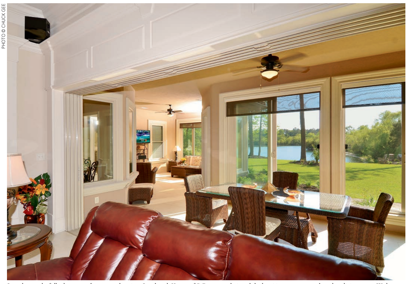
In order to take full advantage of a spectacular view, Landmark Homes of S.C. custom designed the lanai into a year round outdoor living space. With separate HVAC zoned just for this area and impact glass in the sliding doors which allow usage on pleasant days, this space creates comfort for your family year round! The disappearing 4 panel doors allow the great room to flow effortlessly into the lanai.