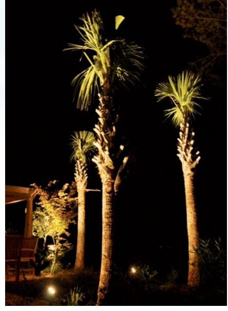
Light Up Your Night!

outdoor space along with overseeing all details of each project is guaranteed. Whether the landscaping venture is large or small, Robert Steuer, Registered Landscape Architect, has the experience to build a wide variety of outdoor features. Indigo Landscaping's broad ability includes creation of distinctive works of outdoor art, elegant arbors, stunning paver designs, unique customized swimming pools,