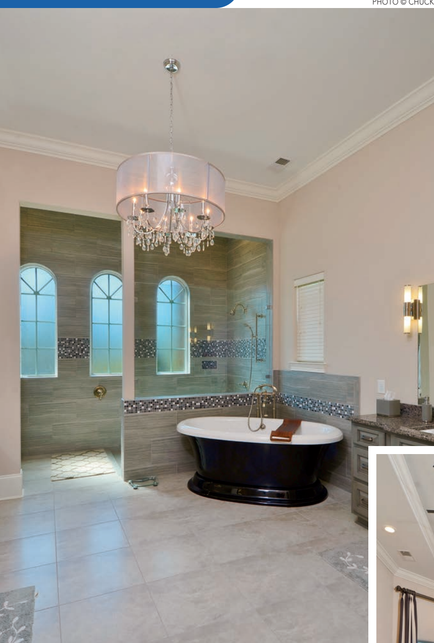
The Biggs' spacious bath room features a stunning tiled shower, a free standing soaking tub and soft spa lighting. All of these features assist in enjoying the peaceful serenity of this master suite retreat.

Wow! Stunning only begins to describe this master bedroom retreat in the Biggs' residence! Tray ceilings, recessed lights, hidden ambience lighting tucked behind ceiling trim and large bay windows all contribute to a perfect setting to unwind, relax, and enjoy the view of the pool and the patio.