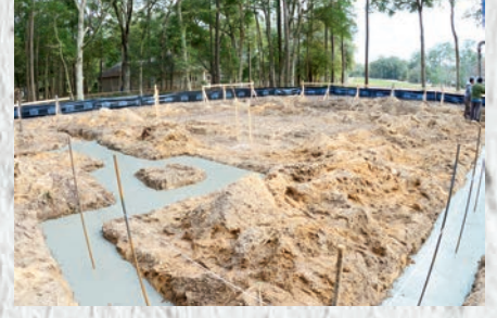
A concrete footing project.

relationships of trust and financial accountability are a part of the provided business plan. As a full service turn key company, Professional Concrete, Inc. requires no money out of pocket from the builder until the job is complete.