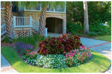
Earth Laughs In Flowers' – quote by Ralph Waldo Emerson.

outdoor space along with overseeing all details of each project is guaranteed. Whether the landscaping venture is large or small, Robert Steuer, Registered Landscape Architect, has the experience to build a wide variety of outdoor features. Indigo Landscaping's broad ability includes creation of distinctive works of outdoor art, elegant arbors, stunning paver designs, unique customized swimming pools,