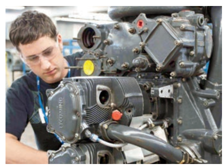
Student being trained to work on airplane engines at the Pittsburg Institute Of Aeronautics – Grand Strand Campus.

With an abundance of recent graduates entering the workforce from Coastal Carolina University and Horry Georgetown Technical College, our already strong workforce continues to grow with young, knowledgeable employees who are ready to work.