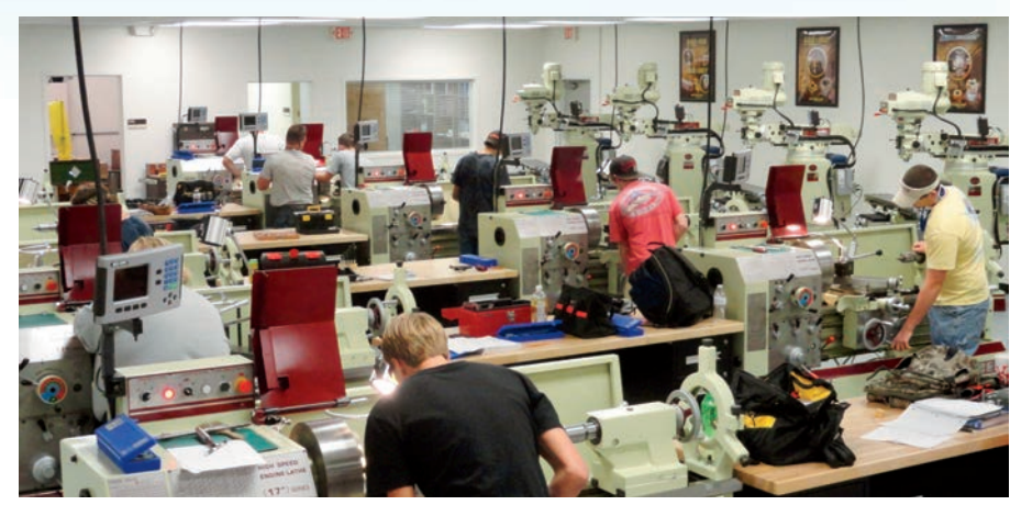
Machine Tooling students training at Horry Georgetown Technical College.

South Carolina ranks in the TOP 5 for workforce development programs in the United States and is touted as one of the most productive in the country.