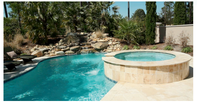
A beautiful vanishing edge pool with oceanfront view.