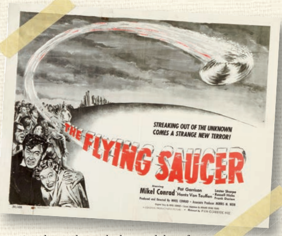
Popular media made the possibility of Flying Saucers real in many minds. "The Flying Saucer" was released in 1950.

After a half hour, Marlowe heard what sounded like "electric motor under