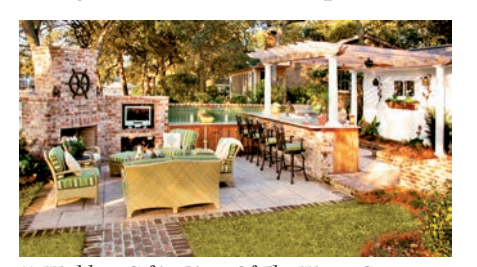
'A Wedding Gift' – View Of The Water. Green glass tiles compliment an outdoor custom kitchen area enhanced with a flat screen TV and fireplace. This outdoor space can be used during all four

Indigo Landscaping And Construction, Inc. is a design and build landscape firm. Offered is every aspect of landscape installation from conception to design, including assuming the role of the outdoor contractor if needed. Consistent follow through with installation of all pieces in the