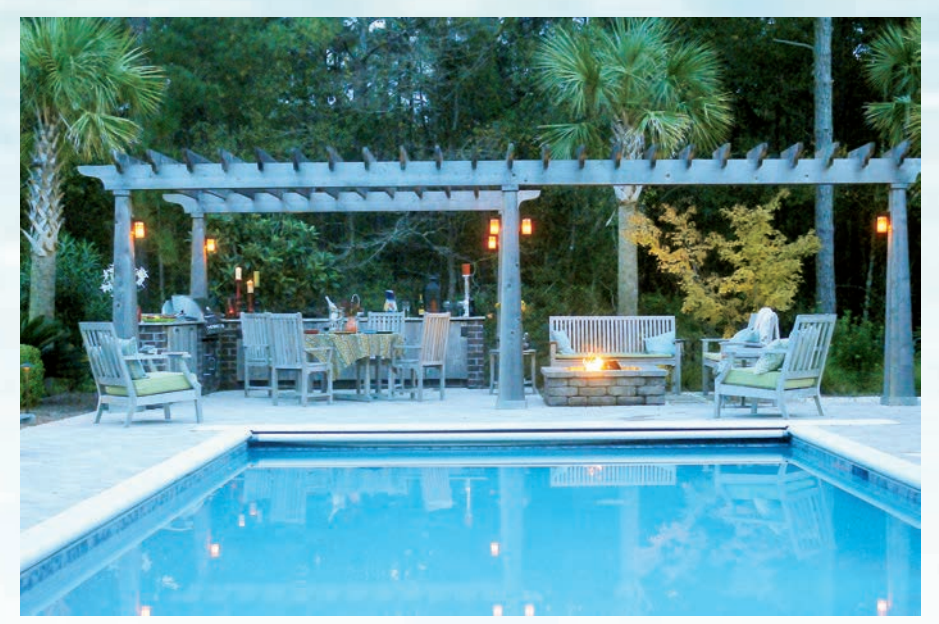
Summertime - When The Living Is Easy.

landscape and lawn designs along with providing professional irrigation system installation and irrigation renovation service when needed.