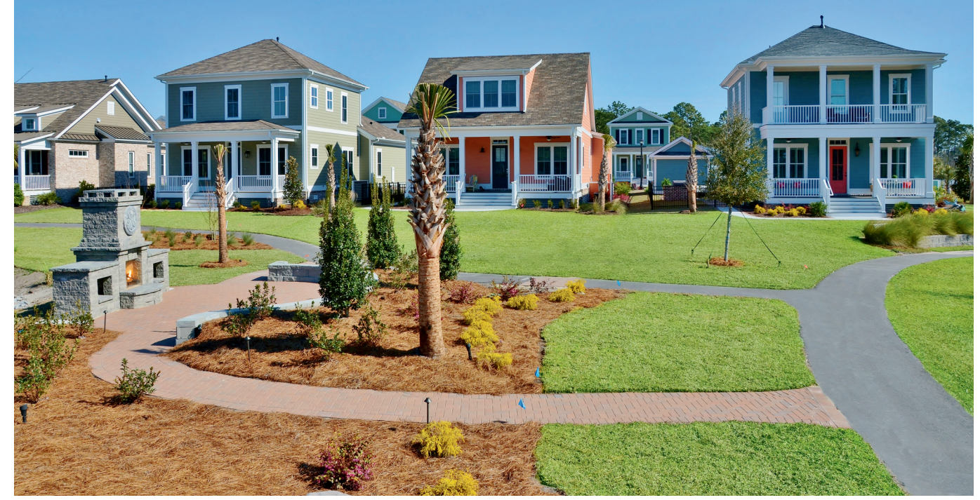
Developers at Living Beach worked with CRG Companies to tap the resources of community planners and architects from around the Southeast known for creating master-planned communities that focus on functional living. Over 8 miles of walking trails and 10 acres of lakes serve to connect homes with the green spaces and, ultimately, homeowners with the beauty that surrounds them. At the very heart of the community is an outdoor amphitheater, lakefront boardwalk, outdoor fireplace and community clubhouse, complete with a junior Olympic pool.

From ethical design to superior green building practices, the CRG team is committed to exceeding code standards and customer expectations. CRG Companies blends custom construction, real estate, and architectural design services under one roof to seamlessly provide attentive customer service, quality construction, and ethical building methods resulting in unique, built to last, homes.