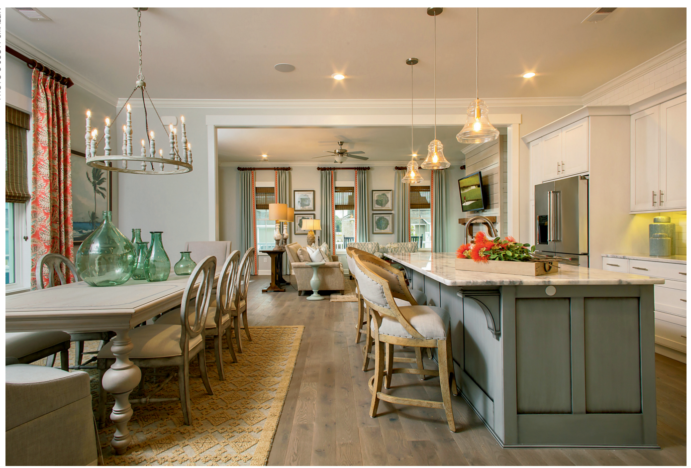
Embodying the higher standards CRG Companies is known for, the style and quality of the finishes inside the homes at Living Dunes create beautiful, yet functional living spaces. The design and interior selections team at CRG Companies is proud to partner with top vendors who help maintain a higher standard of quality in every element of the Living Dunes home.

One of their most recent projects, Living Dunes, a neighborhood in the Grande Dunes that will be home to over 200 families, is a prime example of the