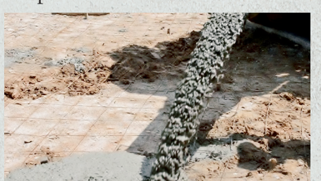
Thomas Concrete is currently introducing their new 'Carbon Cure' technology.