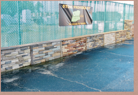
The stone displays on the outside of the Palmetto Brick showroom. The company is noticing a higher demand for outdoor kitchens and outdoor living spaces to upgrade new and existing homes.

for gaining inspiration or refining one's vision of a finished product. Whether it is a brick home or garden wall, a handsome, functional brick fireplace, or an entire pool surround and outdoor kitchen Palmetto Brick Company strives to be a builder's and homeowner's top partner for realizing their projects.