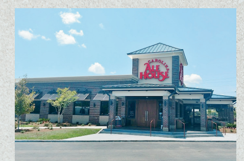
East Coast Masonry & Stone handles a lot of commercial construction.