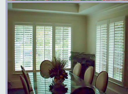
The exterior & interior views of the increasingly popular traditional Plantation shutters. Burroughs Shutter Company has seen a higher demand for interior shutters over the past couple of years.

reported that traditional plantation shutters continue to be popular. Shutters are offered with 2.5”, 3.5” and even 4.5” louvres, all with different mounting options. Light, sun, heat and glare control are factors in decisions about window treatments. Matt added, “For example, interior roller and solar shades have become extremely popular with homeowners and businesses. They can be manually operated or motorized. With all the