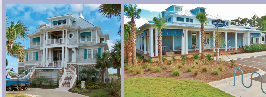
Residential application of Bahama & Colonial shutters on the left & a Commercial application of the Bahama shutters on the right.