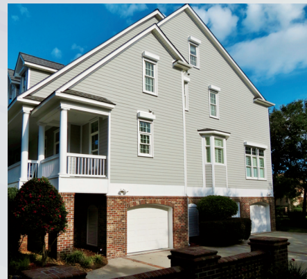
Roll down shutters.