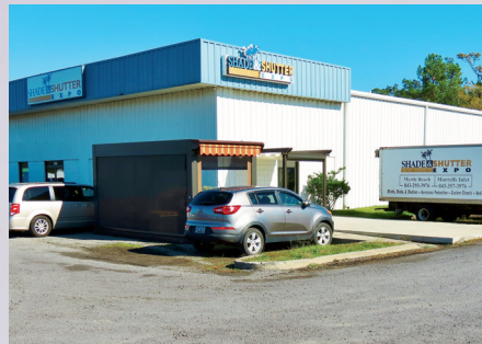
The Shade & Shutter showroom is located at 3147 Fred Nash Blvd. in Myrtle Beach (on the frontage road off of Bypass 17 between Hwy. 501 & the back entrance to Market Commons).

For clients having trouble visualizing the fit and finish of a window treatment, Shade and Shutter Expo has a beautiful showroom. Owner Danny Fergus said,