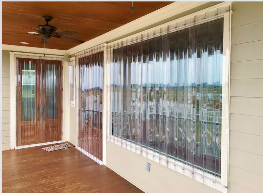
Clear track panels.

a lot more roll down and accordion shutters. People want to be able to close them up quickly – they’re not labor-intensive. The other products Burroughs Shutter Company has been selling a lot of lately are aluminum panels, clear-track panels and fabric panels. Clear track panel