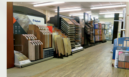
Waccamaw Floor Covering has a 12,000 square foot warehouse & showroom to better accommodate their retail and builder customers.

Bryan has noticed that the standard popular hardwood of years past, is not selling as much now. More people are using hard surface floors now, whether it is laminate, tile or some higher end hardwood. "I think it's due to a lot more pets in the home and a lot more allergy issues. We seem to be selling a lot more vinyl plank than in years past", says Bryan.