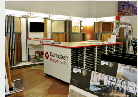
The J & S Flooring warehouse & showroom is located @ 2104 S. Fraser St. in Georgetown, SC.