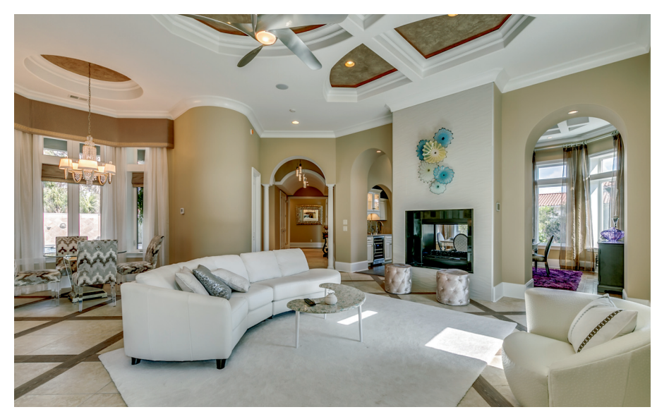
The residence of Mark and Darlene Vesely built by Annas Development & Building is located in the Riveria section of Grande Dunes. Shown is the open floor plan living area with customized tray ceilings, faux accent painting, and double-sided linear fireplace giving the home a modern and sophisticated appeal

Annas Development & Building has constructed around 30 custom