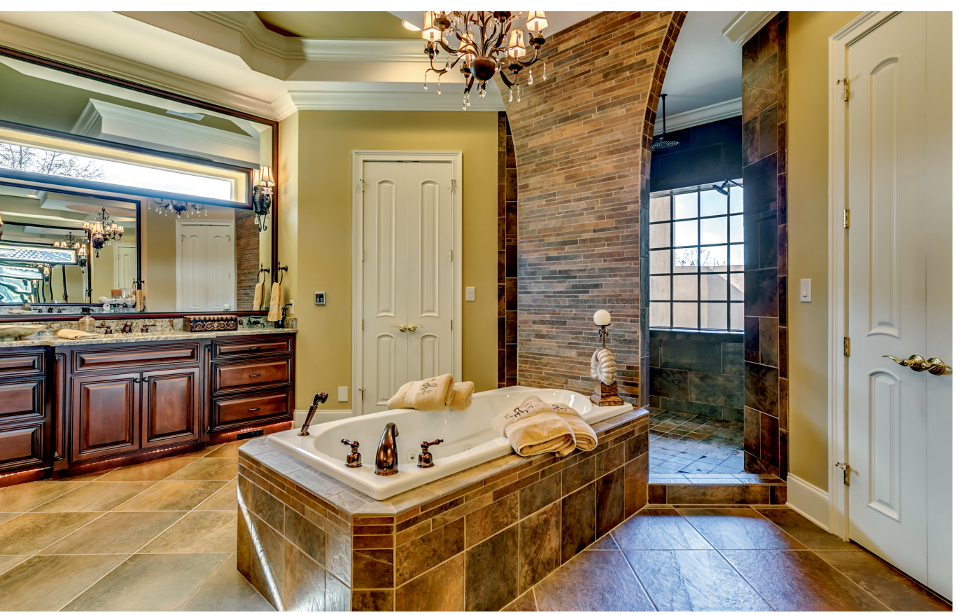
Shown is the master bath area in the Annas Development & Building model home located in Grande Dunes. This master bath area features granite countertops, porcelain tile floor, jacuzzi tub surround, and walk-in shower area. A very large wall-to-wall mirror with recessed lighting and window to access natural light, highlight one side of the master bath.