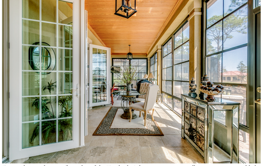
To complement the open floor plan of the Heatherley's home, an expansive all seasons area was added for entertaining and relaxation. The natural light and the ability to open and close the screened windows allows this area to be utilized throughout the year no matter the season.