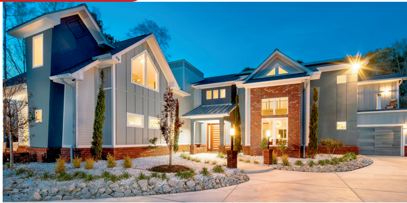
Tungsten utilized a nice balance between clean modern lines and traditional materials on this residential home. The exterior finishes included sand faced brick, EIFS, Hardie siding, Hardie board and batten, as well as a mix of shingle roofing with metal accents and a custom front entry door.