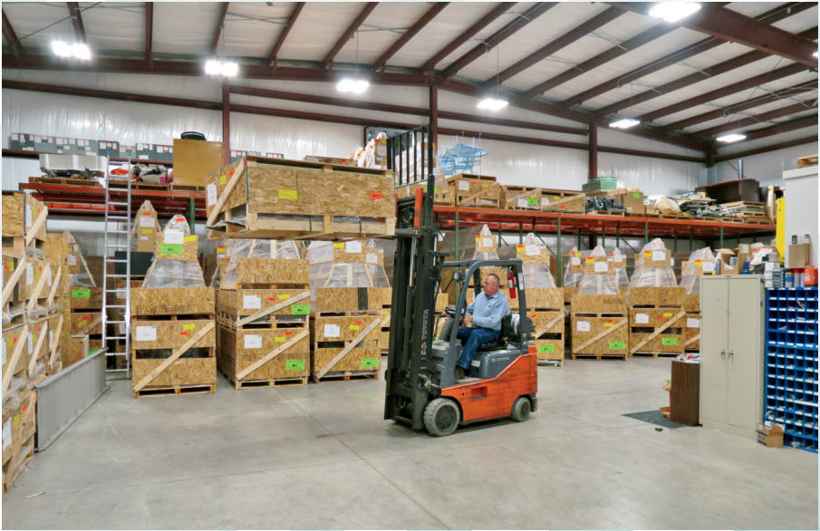
The inside of the Port City Elevator warehouse @ the corporate office.

quality products and a team that is professional, highly trained, and caring. One other plus to working with Port City Elevator is they always purchase and install complete unit packages. “Every elevator package we sell has been 3rd party inspected as a unit with all parts working together,” Seth added. That means technical support from the manufacturer is included with every system which keeps the homeowner from