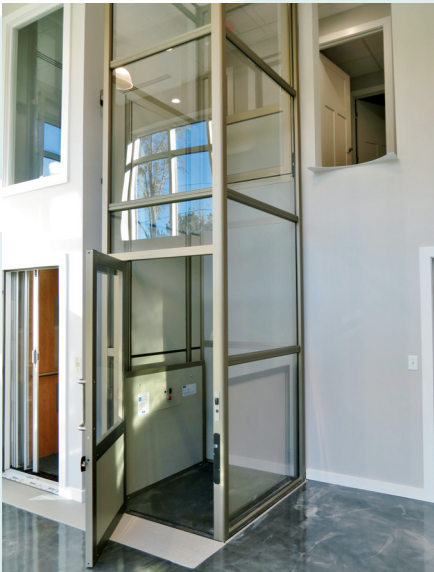
Port City Elevator’s showroom @ the corporate office.

options when it comes to adding an elevator to existing structures as well. “People who have had a house at the beach for a while get tired of lugging groceries and luggage up all the time,” Seth stated. They’ve seen a significant increase in requests for accessibility