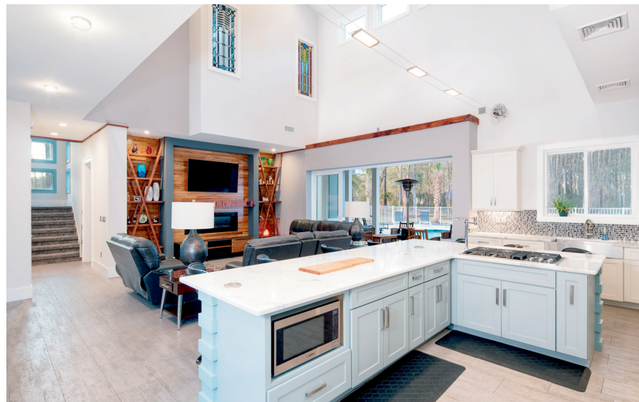
The interior of the home seen above features a kitchen island with a gas cook top, entertainment sink and cable lighting system. There is a pocket sliding rear door for concealment, as well as custom built in shelving featuring an 'X' brace design, fireplace and cedar mantle.