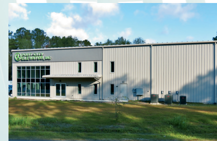
The Port City Elevator corporate office @ 5704 Nixon Ln. in Castle Hayne, NC services the Horry & Georgetown area.

Home and business automation these days includes more and more ways to mechanically get into or around your home. The individuals at Port City Elevator in Castle Hayne, NC are the best resource to discuss accessibility needs. The company not only sells but also services residential elevators, platform lifts, dumbwaiters, stair lifts and other accessibility equipment for builders and homeowners. They also help small businesses, schools, churches, and private clubs acquire wheelchair lifts and LULA