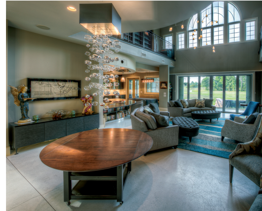
The interior living area of the Dye Estates' home has a cascading feature light below the interior 'Juliet' balcony, kitchen peninsula with a hidden overhead compartment for the projector, clerestory windows, a folding nana door, custom guard rails and stained concrete floors.

The bible college was located on the former air base, and they had purchased an old bowling alley on the base that they wanted to renovate into a K-12 academy. David said, "Of