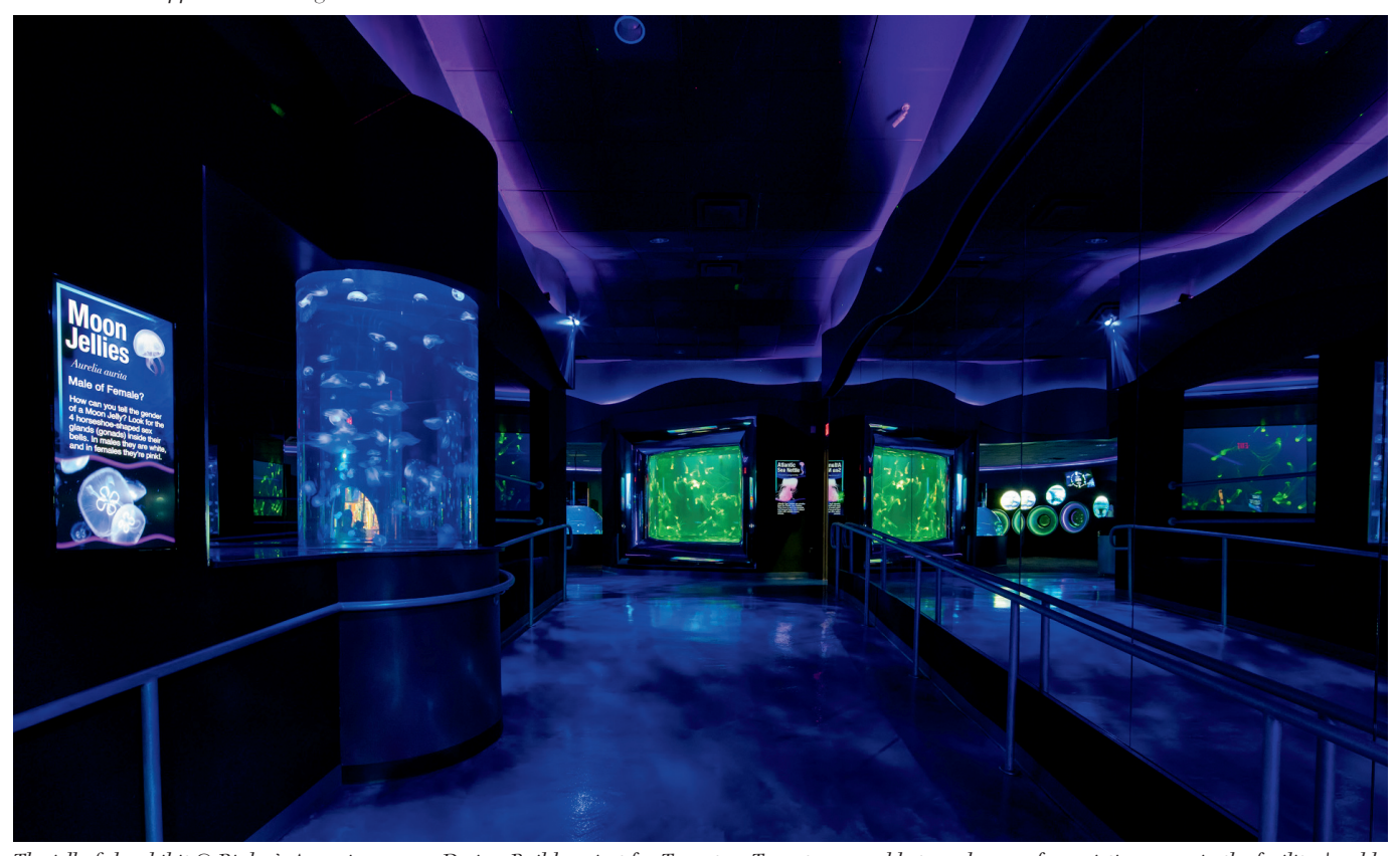
The jelly fish exhibit @ Ripley's Aquarium was a Design-Build project for Tungsten. Tungsten was able to make use of an existing ramp in the facility & add cylinder tanks on the left and anchor the view with a tank surrounded by a custom shroud. The other features that add to the whole experience are the curved walls, mirrors, black lighting and epoxy floor. The use of all of the mirrors creates a fascinating display.