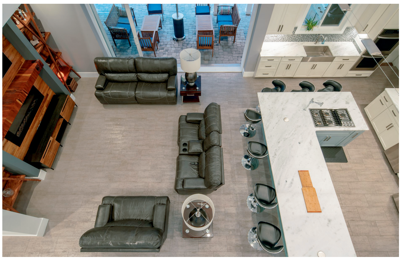
The view looking straight down from the catwalk seen above.

22 | Building Industry Synergy | 2018 NOVEMBER-DECEMBER | Building Industry Synergy | 23