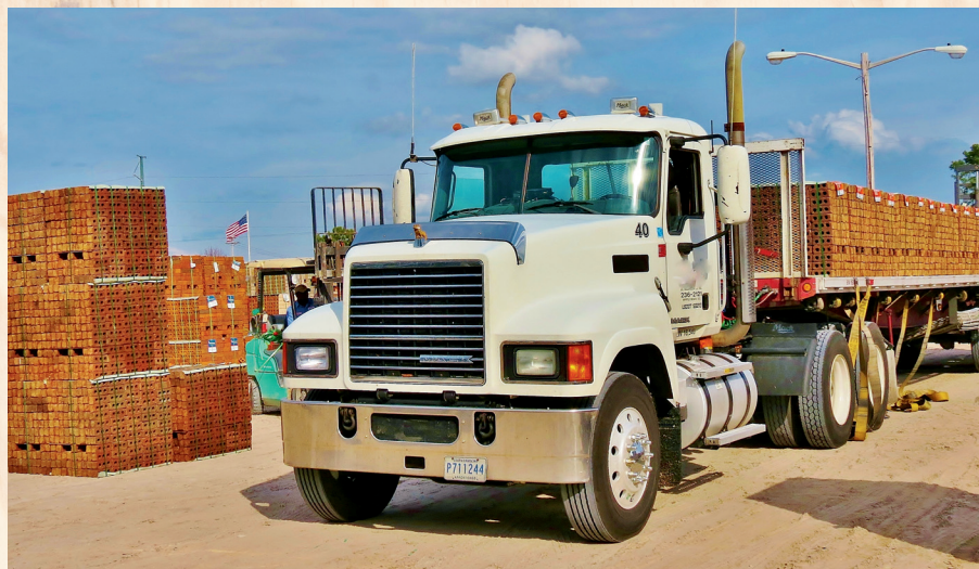
Palmetto Brick is celebrating its 100 Year Anniversary in 2019.

Even track builders are using more brick than siding these days which makes practical sense. Brick has a longer life, acts as a natural insulator, provides a moisture barrier, adds strengths and durability, and offers worry-free maintenance. In a development where all the brick matches, Chad states it's possible to still make your home stand out. "Using the same