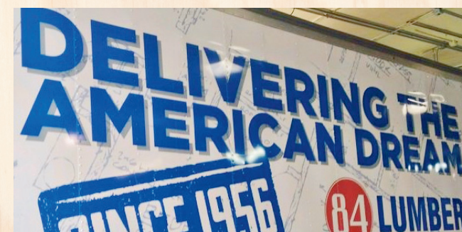
84 Lumber is located @ 811 Lumber St. in Myrtle Beach.