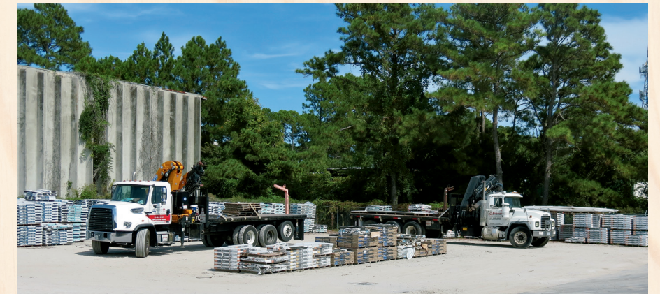
Eastern Building Supply is located @ 1101 Campbell St. in Myrtle Beach.