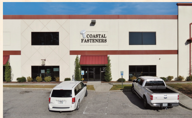
Coastal Fasteners & Supply is located @ 1330 17th Ave. South in Myrtle Beach, two blocks behind Coastal Grand Mall on Robert Grissom Pkwy.