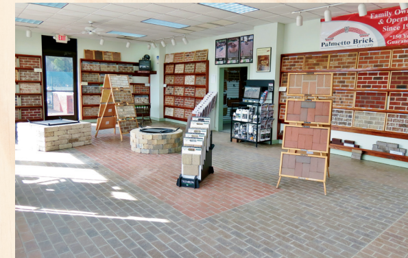
Palmetto Brick is located @ 305 Greenleaf Circle in Myrtle Beach just across from the Tanger Outlets on Hwy. 501 (Turn towards Chick-fil-A @ traffic light).

and size options available. In Myrtle Beach, they are located on Greenleaf Circle just across from the Tanger Outlets on 501. Other SC locations are in Florence and Cheraw and in NC: Monroe and Hampstead. When you stop by, be sure to wish everyone there a happy 100th anniversary! ■