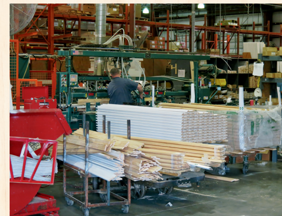
The Builders FirstSource location with manufacturing facility is located @ 651 Century Circle in Conway, behind Lowes on Hwy. 501.

framing, windows and doors, James Hardie siding and interior doors, trim and hardware. By combining installation services with high-quality building products and management of the project, Builders First Source takes pride in providing a turn-key service which allows the Builder to turn his management focus to other areas of his construction project.