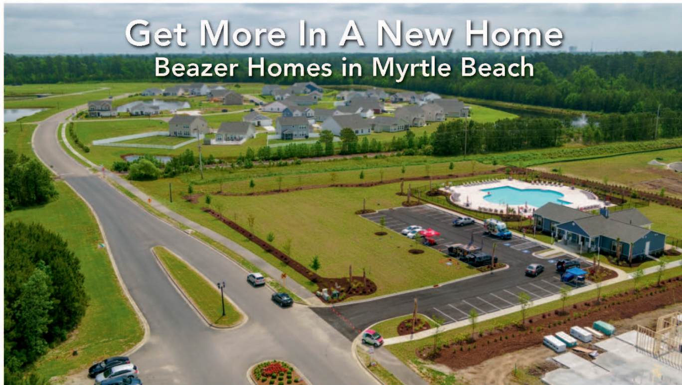
Bella Vita pool, fitness & amenities center