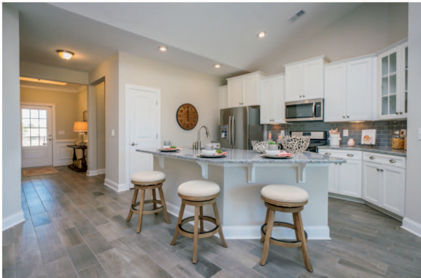
The Hemingway "Choice A" kitchen

living areas at no additional cost. Choice Plans allow changes to rooms like the kitchen, master bedroom, bathroom, or dining room to suit their individual lifestyles.