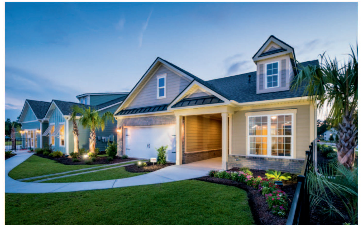
The Hemingway model at Park Place in Market Common