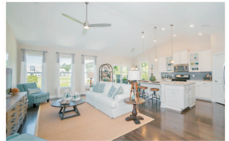
The great room in the Savannah plan

winning school districts, shopping, dining and entertainment districts, and the convenience of major thoroughfares. Each community features individual amenities such as pools, fitness centers, pet-friendly areas, and outdoor sporting facilities. ■