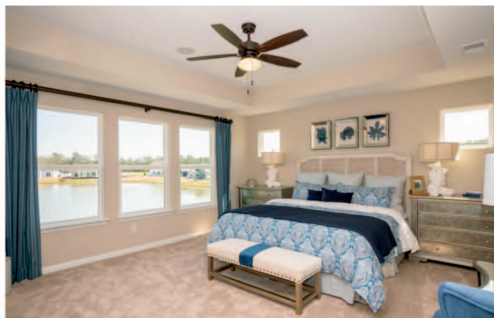
Master bedroom in the Bella Vita Edisto plan