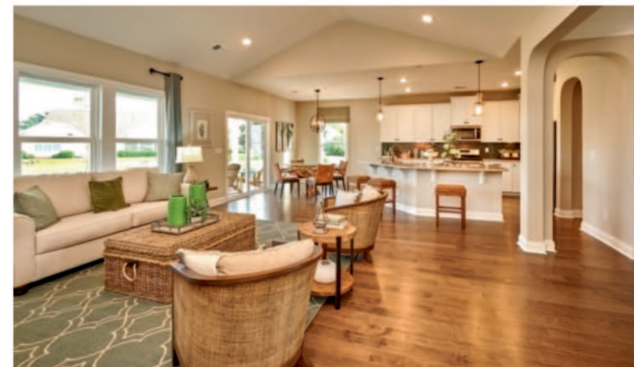
The Reynolds great room at Belle Mer