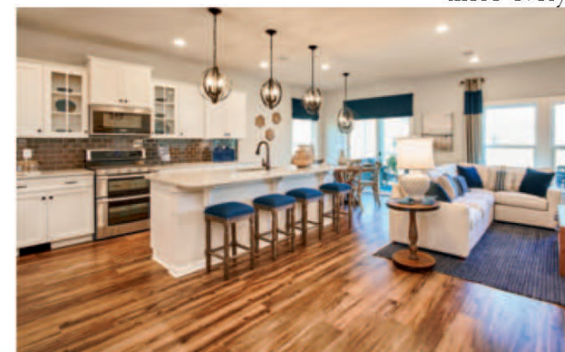
The Windsor kitchen and great room in Surfside Plantation

Beazer’s quality assurance program, Safety, Schedule, Quality, means builders are ever-present on the job