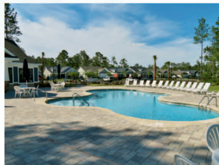
The General Pool Company handles many commercial projects across the Grand Strand as well as residential.

Fire and water are two elements especially suited to the creation of a backyard resort-like oasis. Tommy noted, "Fire features continue to be in high demand, whether it's a free standing natural burning or gas burning fire pit. Fire features include fire bowls, which can be