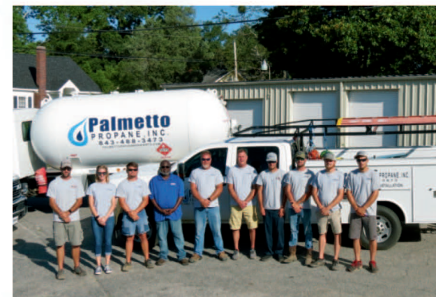
The Palmetto Patio & Hearth / Palmetto Propane team