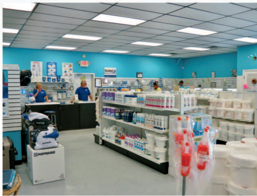
The Sunco Pools & Spas showroom is located @ 116 April Gray Ln. in Myrtle Beach on the Frontage Road that parallels Hwy. 501.

exquisite resort. Sunco has a rich history of new builds in commercial and residential properties, including the pool areas of Island Vista, North Beach Plantation, Oceans One Resort as well as other