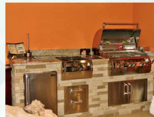
The Palmetto Patio & Hearth showroom is located @ 406 Beaty St. in Conway, SC.