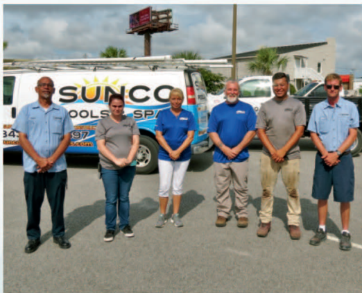
The Sunco Pools & Spas team

Hilton properties. Each inquiry is personally handled with a plan created for each customer depending on their intended use, desired style, and budget. The Sunco Pools and Spas staff uses only the best materials to ensure a beautiful pool for years to come.