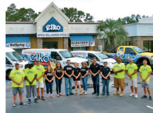
The Elko Spas Billiards & Pools team outside the showroom located @ 4718 Hwy. 17 Bypass & Northgate (on Frontage Road) in Myrtle Beach.