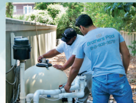
Brothers Pool Construction also handles the design & installation of the pump configuration for pools if needed.

Raymond shared some of the latest trends that he has seen in the