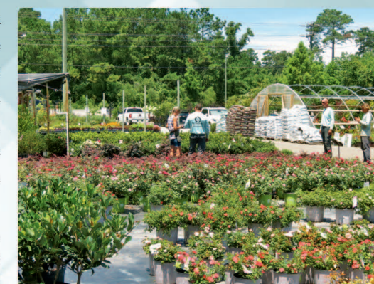
Plants Direct’s 4 acre nursery located @ 2019 Hwy. 544 in Conway, SC.

founded ten years ago and currently has a staff with over 60 years of combined experience and knowledge in all aspects of gardening.