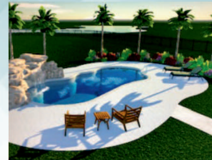
3D CAD design