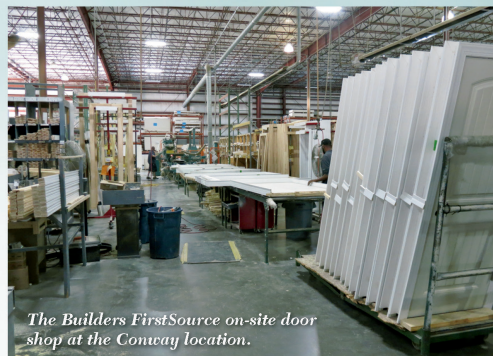
The Builders FirstSource on-site door shop at the Conway location.

"The most basic difference between us and our competitors is that we can control our own destiny as far as customer service goes," Pezzullo said. "We don't have to rely on somebody else to bring us finished product to meet the expectations of our