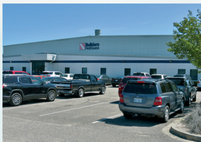
Builders FirstSource in Conway is located @ 651 Century Circle (Behind Lowes on Hwy. 501).

Builders FirstSource operates two locations in the Grand Strand area, each with distinctive features yet both