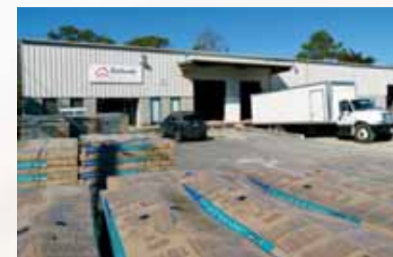
Richards Building Supply (formerly Eastern Building Supply) is located @ 1101 Campbell St. in Myrtle Beach.

Richards Building Supply (formerly Eastern Building Supply) has consistently provided materials to contractors throughout the Horry Georgetown for many years. In 2015, the company merged with the Richards Company and now operates as their East Division working mostly