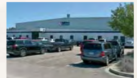
Builders First Source in Conway is located @ 651 Century Circle (Behind Lowes on Hwy. 501).

offering these turnkey services, we continue provide solutions to help our builder partners overcome the challenges they are facing in the market place."