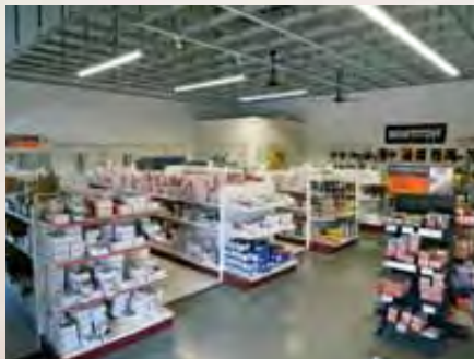
Coastal Fasteners is located @ 1330 17th Ave. South in Myrtle Beach (Two blocks behind Coastal Grand Mall off of Robert Crissom).