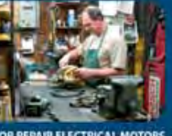
FIX OR REPAIR ELECTRICAL MOTORS