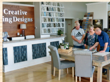
The Creative Flooring Designs showroom is located @ 12082 Hwy. 17 Bypass in Murrells Inlet, SC.