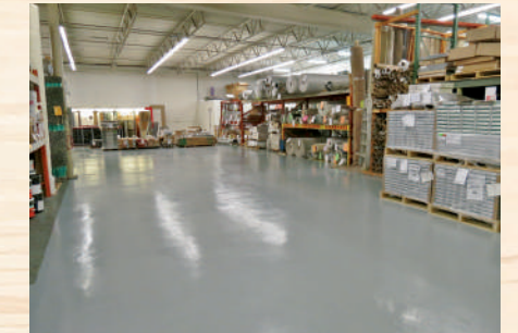
The J & S Flooring 10,000 square foot warehouse & showroom is located @ 2104 S. Fraser St. in Georgetown, SC.

J & S Flooring has provided Pawley’s Island, Murrell’s Inlet, Litchfield, and the entire Grand Strand area with quality name brand products with exceptional service at affordable prices for over 26 years. Catering to both homeowners and building contractors, J & S Flooring has a 10,000 square foot showroom and warehouse, located in Georgetown, which allows them keep a lot of stock on hand for cash and carry projects. They also have a full sample showroom on site. They offer carpet, wood, tile, waterproof