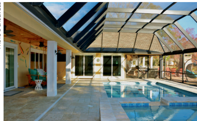
Jon Harrah was asked to step in and complete the design and renovation of Lisa Phillip’s pool area. This installation included Travertine pavers on the pool deck & cultured stone around the raised Jacuzzi with waterfall.