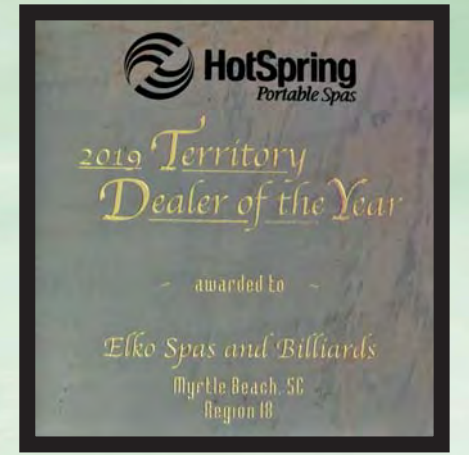
Elko Spas Billiards & Pools was named HotSpring Spas Dealer of the Year in 2019.

The Elko Spas, Billiards & Pools store and showroom is open Monday through