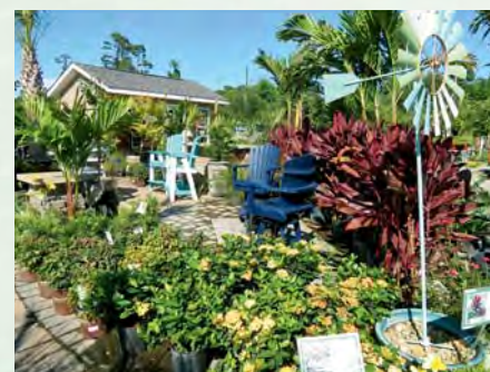
Southern Scapes Landscaping & Garden Center is located @ 1310 Hwy. 501 in Myrtle Beach.