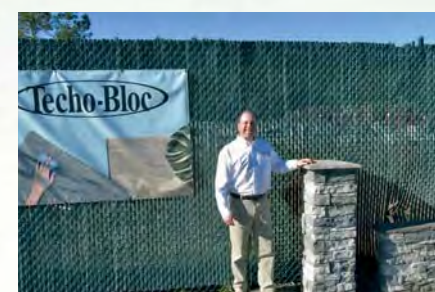
Techo-Bloc has been one of Palmetto Brick's best selling items.

One bestselling item is Techo-bloc, a concrete manufactured product that's been popular in the Northeast for decades.