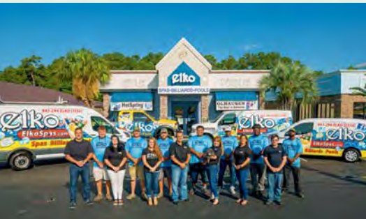
Elko Spas Billiards & Pools is located @ 4718 Hwy. 17 Bypass South in Myrtle Beach.

"Isn't It Time to RELAX?!" Everybody wants to have outdoor fun and enjoyment in the summertime, so why not all year long? The Award-winning dealership Elko Spas, Billiards and Pools is ready to serve both commercial and residential customers to help create or enhance their outdoor or indoor living space.