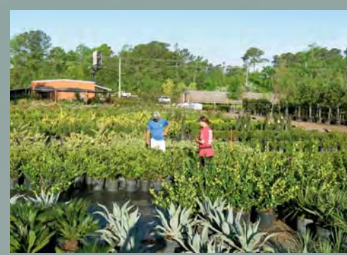
The exterior & interior of the nursery & garden center located @ 2019 Hwy 544 in Conway.

“Many people are sitting at home looking at all these projects they’ve been wanting to do for a long time, and suddenly they have the time to do them,” said Gaskins.