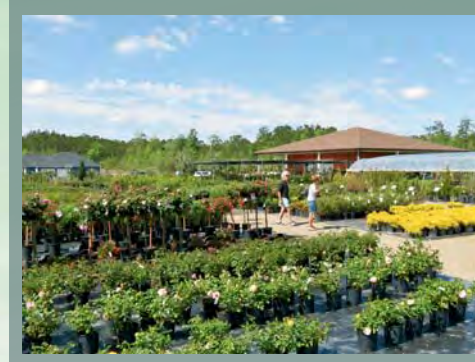
The exterior & interior of the nursery & garden center located @ 1741 Hwy. 57 North in Little River.