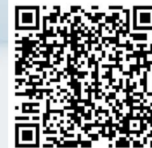
Scan This QR Code To Access Security Vision’s Digital Brochure

Security Vision’s integrated system covers home security, lighting, music, entertainment, garage doors, shades and screens, and personal safety. Even better, individual homeowners may select