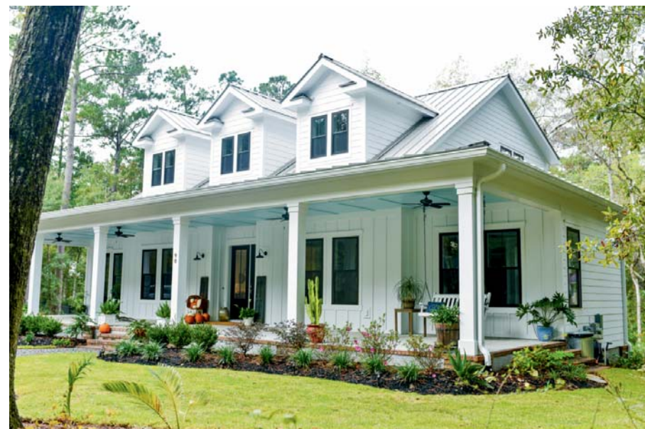
Port City Homes completed this home in Hagley Estates in Pawleys Island, SC.