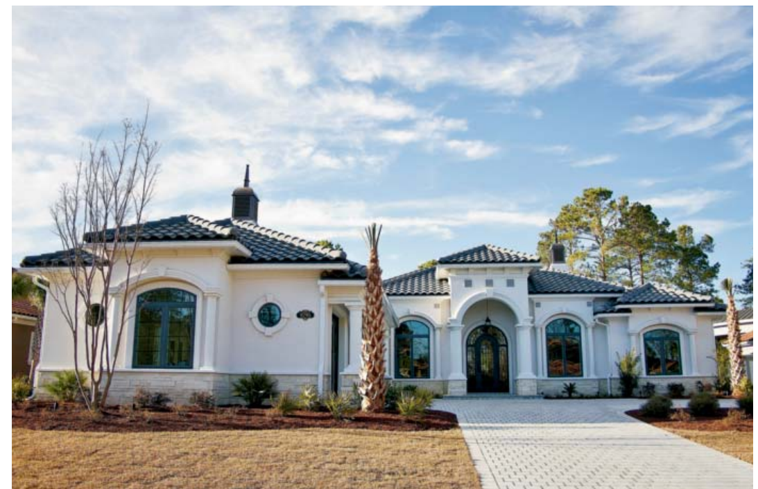
The exterior of the Grande Dunes home shown above.