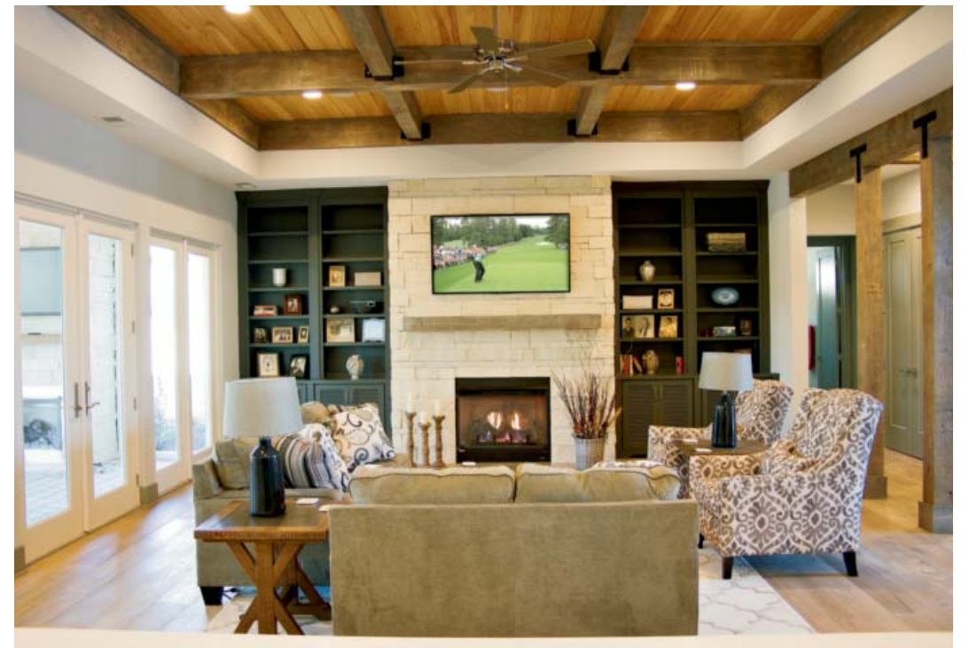
Port City Homes completed this custom home in the Grande Dunes community in Myrtle Beach, SC.