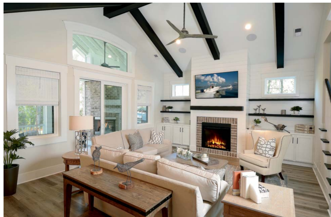
The interior living area in the current Collins Creek Landing model home in Murrells Inlet, SC.