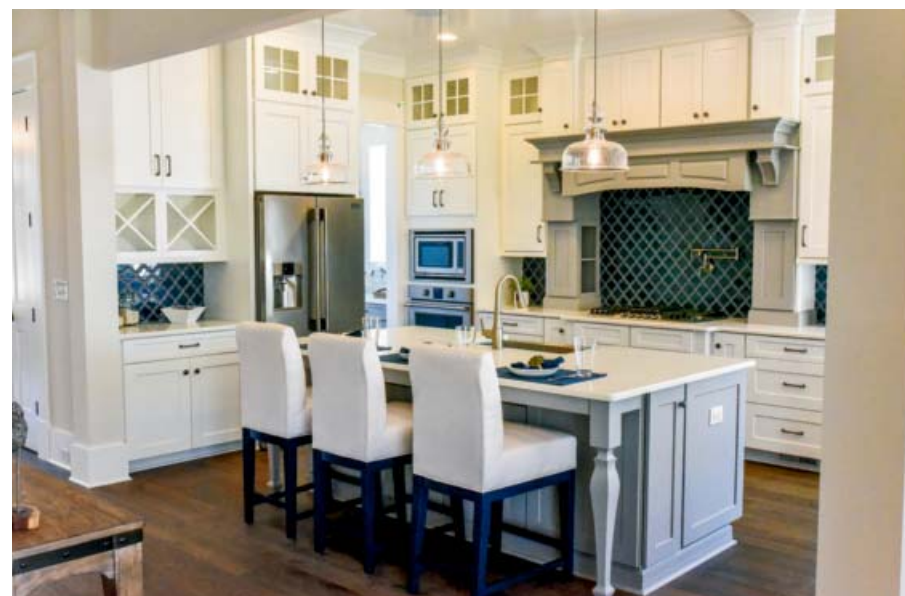
The kitchen in the original model home in Collins Creek Landing.