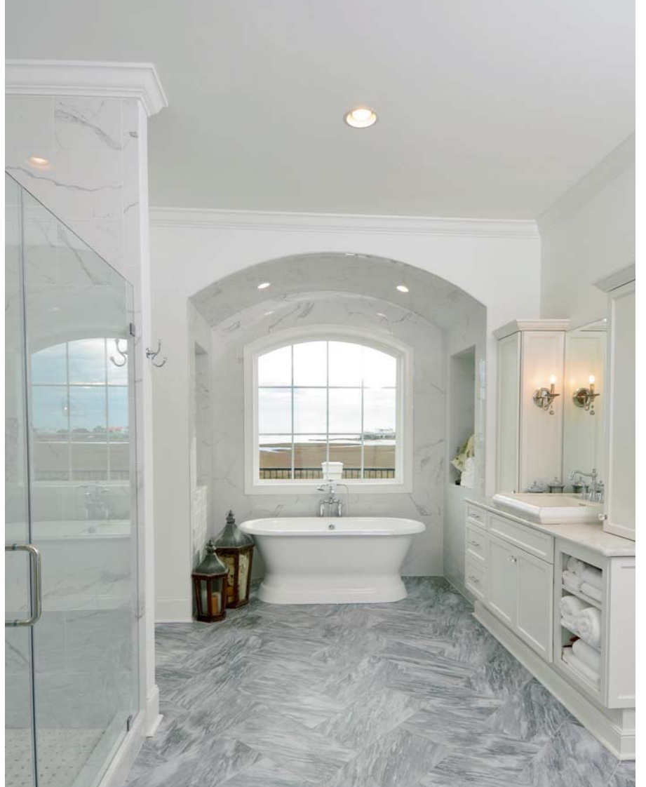
The master bathroom in the Baker residence in Pawleys Island.

18 Building Industry Synergy 2021 JANUARY-FEBRUARY 2021 JANUARY-FEBRUARY | Building Industry Synergy | 19