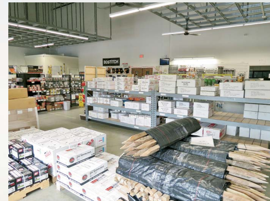
Coastal Fasteners & Supply, Inc. is located @ 1330 17th Ave. South in Myrtle Beach (Two Blocks Behind Coastal Grand Mall Off Of Robert Grissom).

Altman noted that the COVID-19 pandemic has led to some delays in material acquisition, but he works to