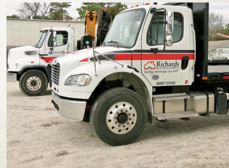
Richards Building Supply is located @ 1101 Campbell St. in Myrtle Beach.

“There are stone veneers mixed with horizontal lap siding