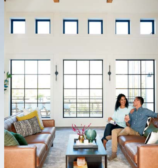
Featuring Pella HurricaneShield® Windows & Patio Doors

“We tell our customers, we have a truck that leaves at 9 a.m., so if you give me your order by