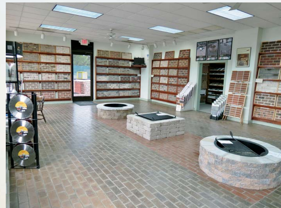
The Palmetto Brick Company Myrtle Beach branch is located @ 305 Greenleaf Circle (Turn towards Chic-fil-a @ traffic light on Hwy. 501).