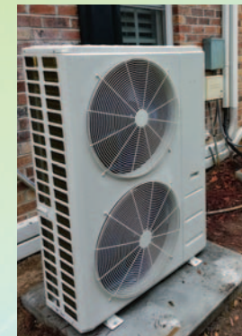
The exterior of a high efficiency mini split system

SEERs skyrocket," said Wulf. "The higher the SEER, the more efficient a particular piece of equipment is. We used to consider 18 SEER as the maximum, but now we can get up to 22 or 24 SEER. As you go up in energy efficiency, that's when you see a payback in your electric bill."