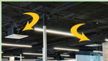
Variable Refrigerant Flow (VRF) equipment operates to match the needs of the space, rather than pumping at a static preset pace & the units correspond to a higher seasonal energy efficiency ratio (SEER) resulting in lower power bills for the owner.

Verlon Wulf purchased Carolina Cooling and Plumbing in 1999 when it was comprised of just 8 employees. In 2008, after adding an electrical and solar division, he changed the name to Carolina Cool. Now a booming business with 150 employees and more than 100 trucks on