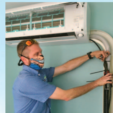
The installation of the interior high efficiency mini split system equipment

An overall home Energy Star certification means that a home is functioning at optimal efficiency throughout several dimensions. It's using less energy and thus wasting the least amount of energy possible from every perspective including water, air, insulation, doors, and windows.