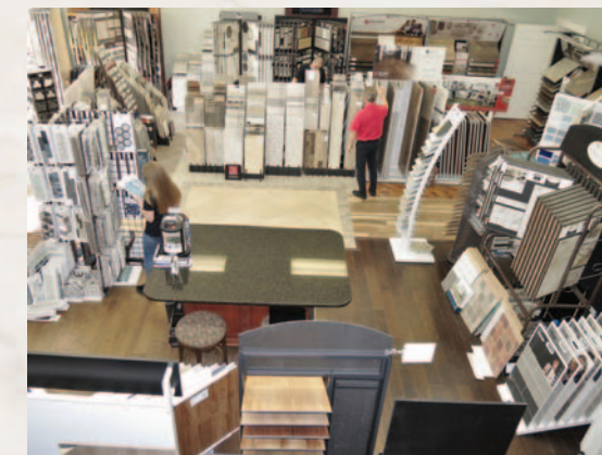
Flooring Panda is located @ 864 Kingswood Dr. in Myrtle Beach, SC (Behind Suds Car Wash on Hwy. 544). They also have a 2nd location @ 5298 Main St. in Shallotte, NC (Next to the NC DMV).

Pando also emphasized that regardless of the size of a job, every customer of Flooring Panda’s is treated