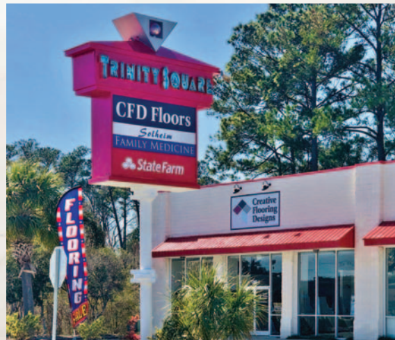
Creative Flooring Designs is located @ 12082 Hwy. 17 Bypass in Murrells Inlet, SC (Across the Bypass From Inlet Square Mall).

They offer a full gamut of flooring materials, from carpet and hardwood to ceramic and luxury vinyl plank/tile. Terrell works with homeowners on both existing homes and new construction as well as builders and businesses all along the Grand Strand on floors, bathroom renovations, custom patios, porches and kitchen backsplashes.