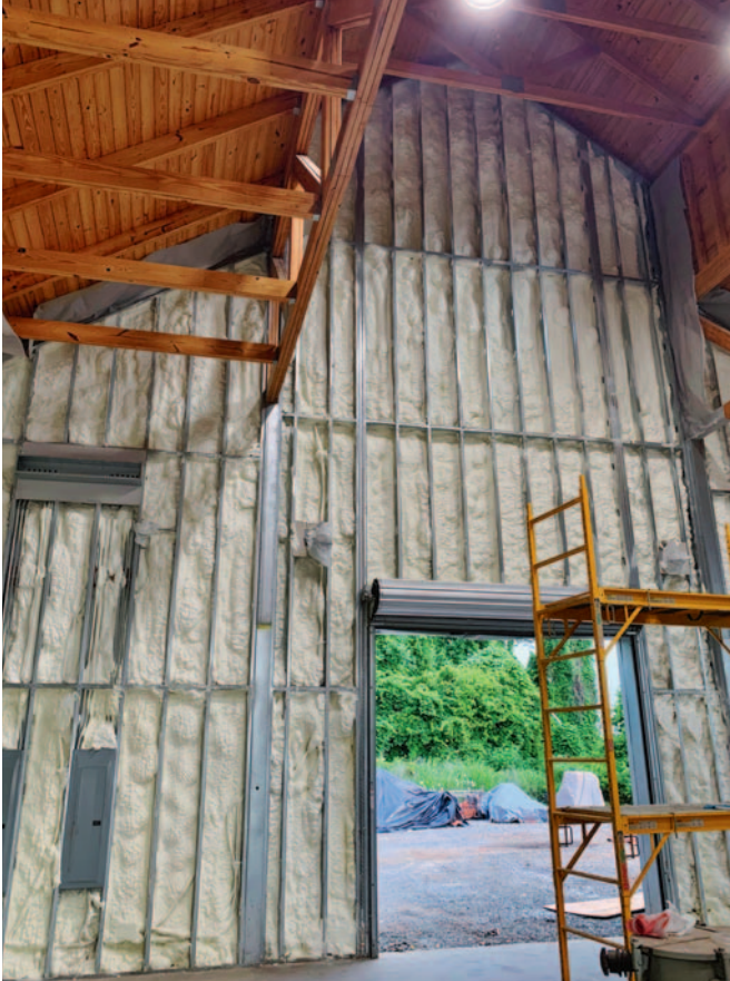
Spray foam insulation can be applied to metal buildings as well as traditional stick built buildings and is equally effective for both types of construction.

“We spray 3 inches on the roof. The foam dries a little differently; it takes about six seconds to dry, so it molts down and looks a little better on the roof,” said Relford. “After it’s sprayed, we go back and spray silicone on top of it as a barrier against sunlight. Every ten years we just spray it on top, and now you’ve got a metal building that will never leak. Now you have a metal building that is insulated, which is unheard of.” ■