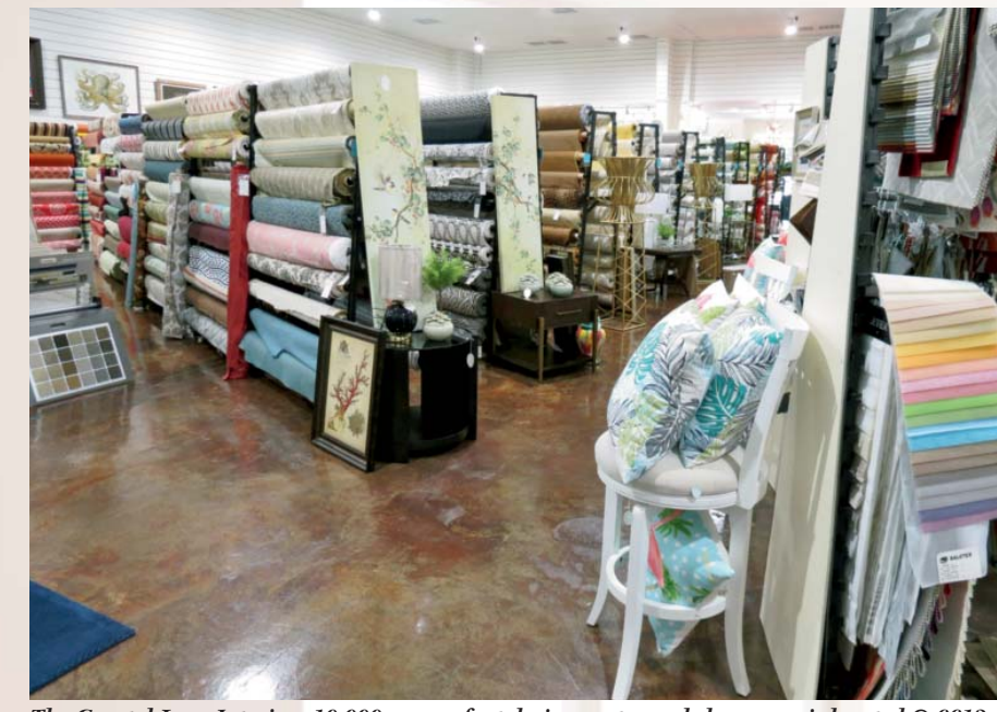
The Coastal Luxe Interiors 10,000 square foot design center and showroom is located @ 6613 N. Kings Hwy in Myrtle Beach, SC.

Hollerbach also noted a recent proliferation of motorized window treatments, which can be hard-wired during construction or added with a remodel using a battery pack.