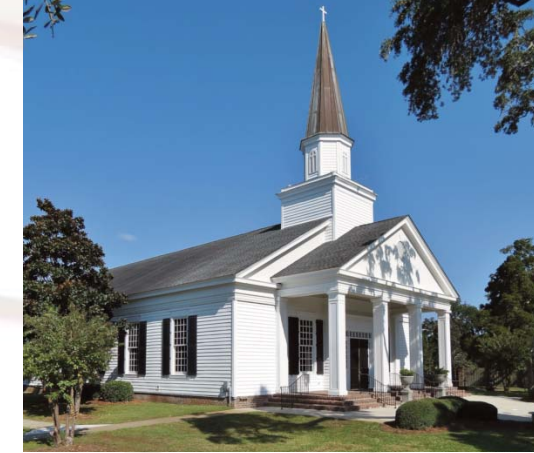
Burroughs Shutter Company installed Colonial "They're rolling shutters on Belin Memorial United Methodist Church in Murrells Inlet, SC.

These screens are perfect for screened-in porches or partially enclosed outside living areas, and they also extend the use of the area