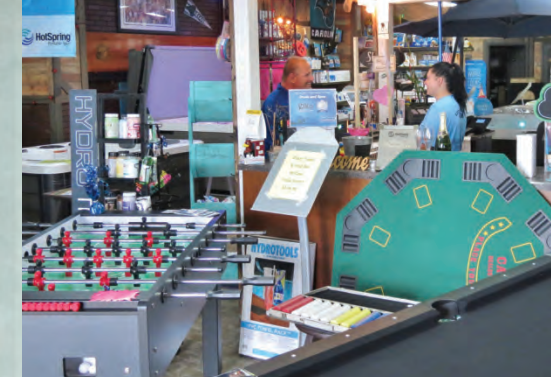
The Elko showroom is packed with examples of gaming and amenity items to select from, in addition to the many hot tubs on display.

The Elko Spas, Billiards & Pools store and showroom is open SIX