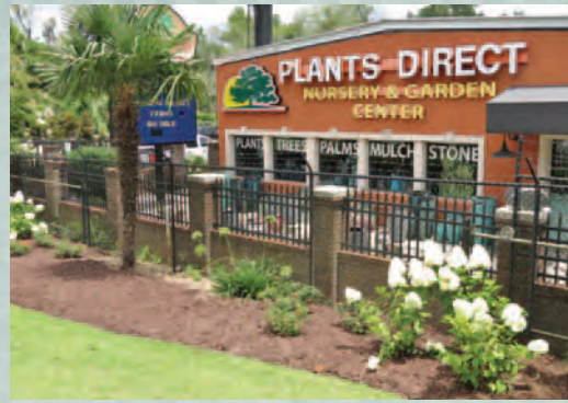
Plants Direct's south location @ 2019 Hwy. 544 in Conway, SC.

If you're considering any kind of outdoor project, your first stop should be Plants Direct , serving the entire Grand Strand and southeastern North Carolina with locations in Conway and Little River. With their comprehensive scope, dedication to accountability, and years of experience, Plants Direct will turn your vision for an ideal outdoor environment into reality.