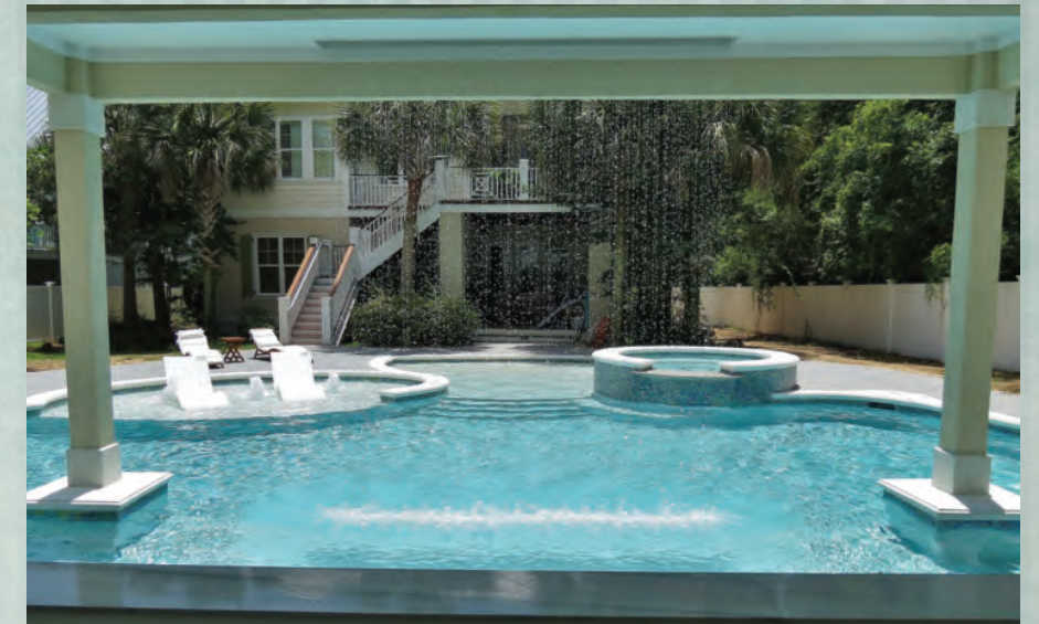
The General Pool Company completed this gorgeous custom pool & outdoor living area for a homeowner in Myrtle Beach.

giving yourself plenty of time to get them in."