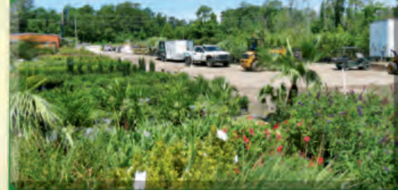
2019 Hwy. 544 • Conway, SC Servicing Southern Horry County & Georgetown County

PALMS • TREES • SHRUBS • PLANTS FLOWERS • HARDSCAPES • MULCH HOME AND GARDEN DÉCOR • FENCING OUTDOOR KITCHENS AND FIREPLACES