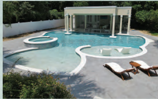
The General Pool Company has been responsible for some of the more elegant outdoor living areas across the Grand Strand over the past few decades.

"The bubblers present a beautiful flume of water as high as three feet, although you can turn them down to 6" in height, and the LED lights in the flumes synchronize with all the other lights in the pool and spa, making for your own backyard entertainment: