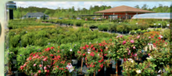
1741 Hwy. 57 North • Little River, SC Servicing Northern Horry County & Brunswick County