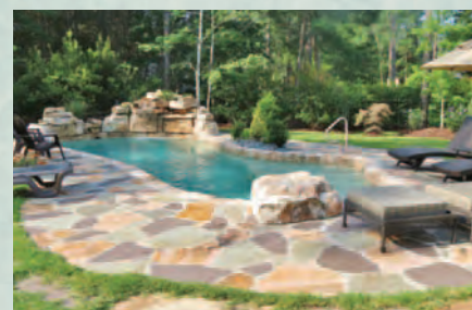
In-ground pool design & installations are available to Elko customers.

You have the opportunity to work with an Elko expert. Your account representative will handle your projects from beginning to end, through the