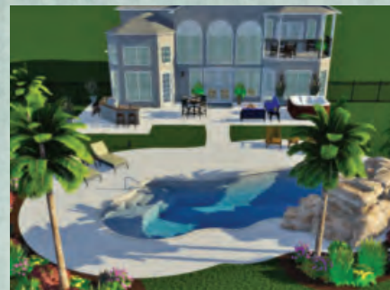
3D CAD designs are available to preview your in-ground pool or outdoor living project.