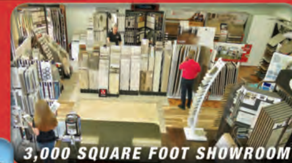
3,000 SQUARE FOOT SHOWROOM