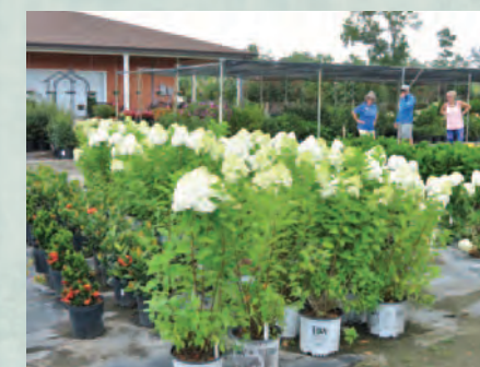
Plants Direct's north location @ 1741 Hwy. 17 North in Little River, SC.

Plants Direct celebrated its 10-year anniversary in 2021, a milestone not easily achieved in today's market.