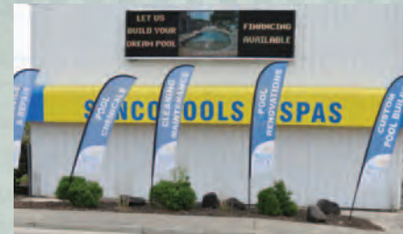
Sunco Pools & Spas is located @ 116 April Gray Ln. in Myrtle Beach, SC.

With more than 30 years’ experience in building residential and commercial pools that add fun and leisure to home life, Sunco Pools and Spas is the