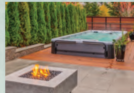
Swim spas are also available to Elko customers.

There is no budget too big or too small. In-ground pools, hot tubs, tables, etc. will be drawn in the previously mentioned 3D CAD program to help each customers envision their project. Call (843) 294-3556 Ext. 3 to reach an account representative ready to walk you through the entire process.