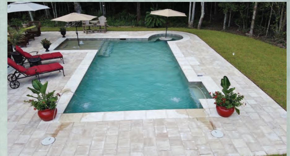
Over the past few years, Sunco Pools & Spas has installed a large number of custom pools across the Grand Strand area.

With Sunco Pools and Spas, the pool build process involves guidance and creativity every step of the way. Designers start with basic questions about shape, size, purpose of the pool, and features, moving on to specific elements of the customer’s vision. Homeowners benefit not only from 30 years’ worth of knowledge and