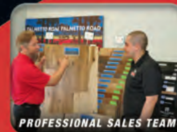
PROFESSIONAL SALES TEAM