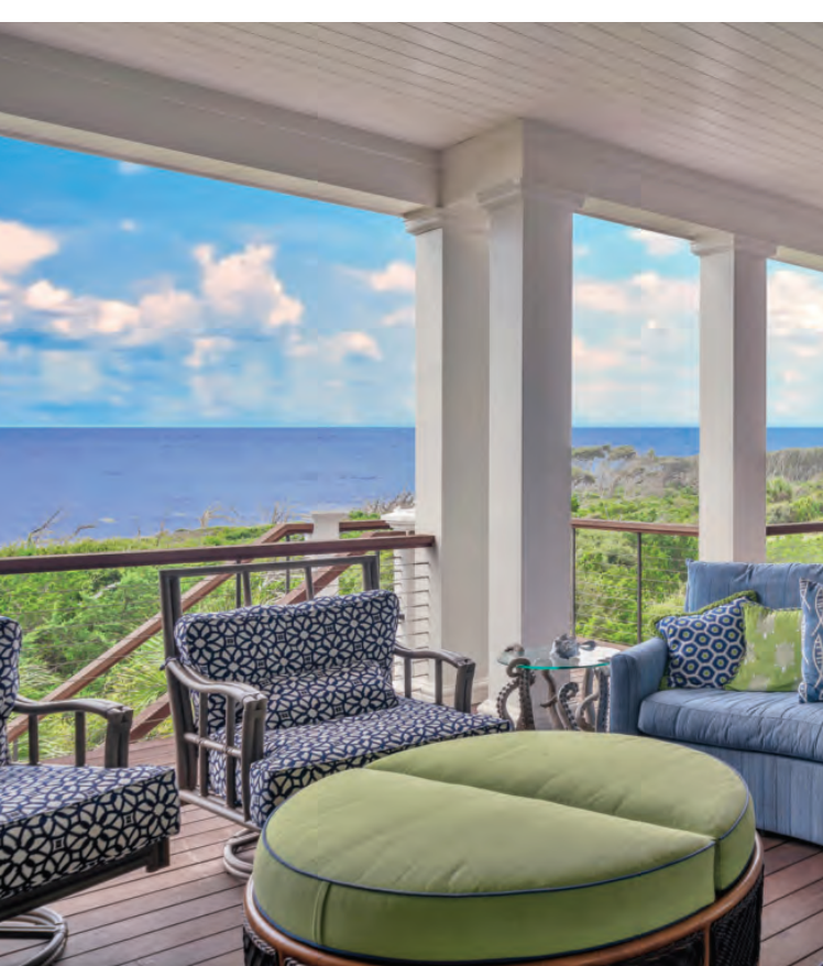
One of several covered porches at the Morgan home, providing outdoor living areas with spectacular views of the ocean.