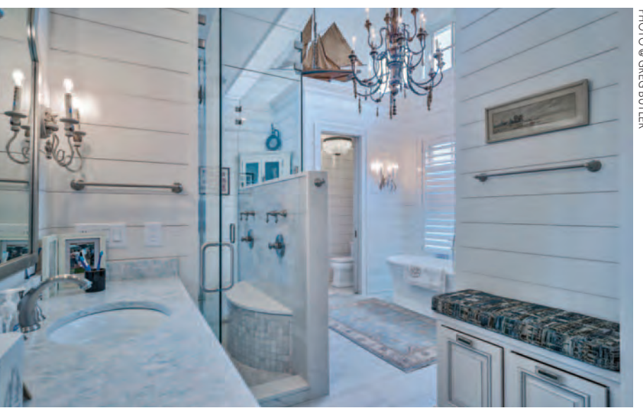
The master bathroom in the Morgan home.

Coastal Builders' custom homes – and the craftsmanship poured into every square inch - are nothing short of magnificent, inside and out. It's what the company was founded on decades ago: to provide higher quality residential construction services to residents on the South Strand. And, to this day, some of the same team members – architects, framing crew and more – have been with Coastal Builders since the company's first build.