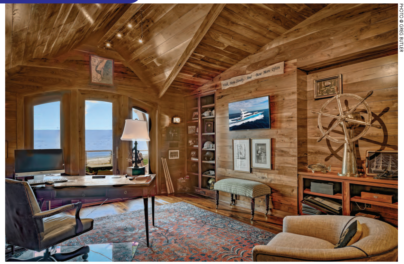
The home office in the Morgan home.

experts at Coastal Builders pride remodeling and building addition