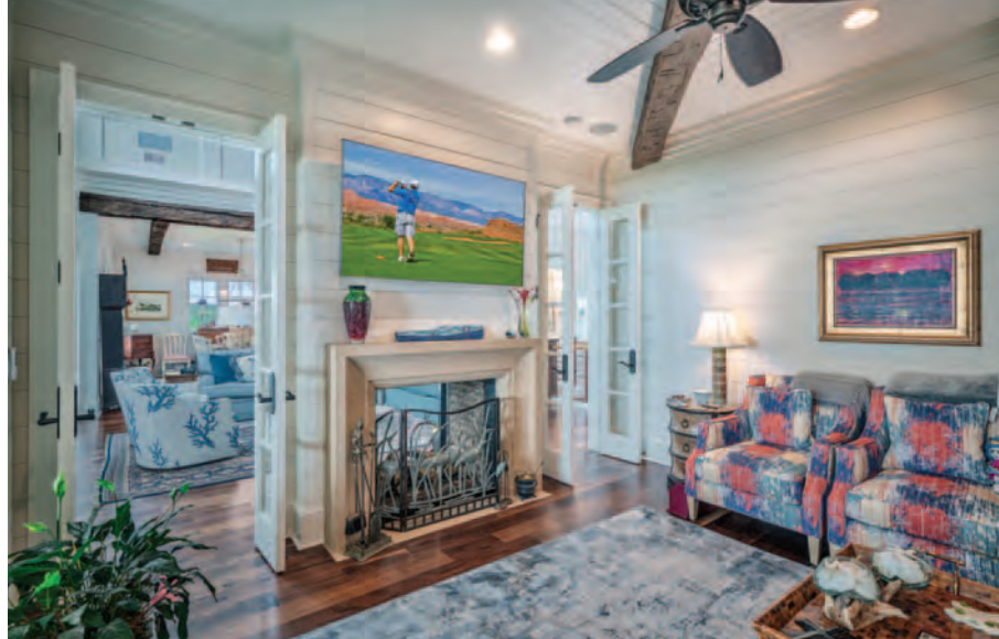
The Carolina (sitting) room with a see through fireplace in the Morgan home.

high-end custom builds, but they The only thing common also take on renovation, throughout these exceptionally