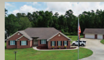
Spann Roofing is GAF master elite certified and a member of the association’s Presidents Club.