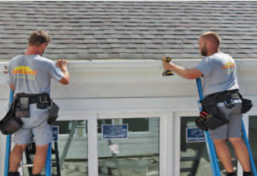
Suncoast Building Products & Services has been installing custom seamless gutters for building contractors and homeowners for over 20 years & is widely considered one of the premier installation companies in this area.

pop ups, diverting drains and downspouts can be key to moving water away from your property. Roof pitch is another factor of whether you will need a standard or commercial size