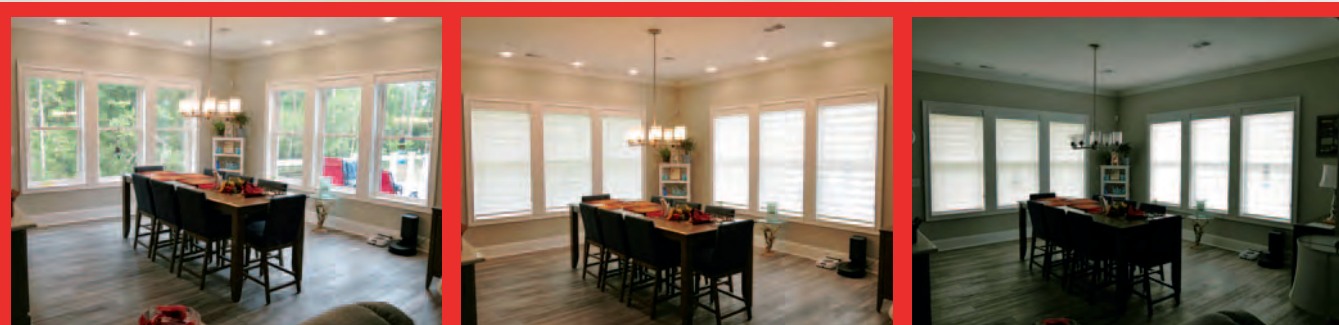
"If you roll a blackout shade down, you can't see out, whereas the Perfect Sheer shades have fabric veins in between two pieces of fabric, so when the reel rolls down and rolls up again, the fabric will actually open up. It lets you see through two layers of sheer in the fabric, and it also gives it a kind of plantation shutter or louvered look", says Matt Burroughs.

meet with the homeowner at their home, in person, so he can learn about their tastes and their goals.