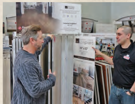
Visit the Flooring Panda showroom, located @ 564 Kingswood Dr. (Behind Suds Car Wash Off Hwy. 544), to learn more about Karndean LooseLay & other flooring products, or call (843) 234-2877.

Since Designflooring is comprised of individual wood planks and tiles, should damage to one or two occur, they can be easily replaced by your installer using spares from your original installation. This is a huge advantage over products that are supplied on a roll such as carpet, linoleum and sheet vinyl and click together floors such as laminate, as damage means a costly replacement of your whole floor.