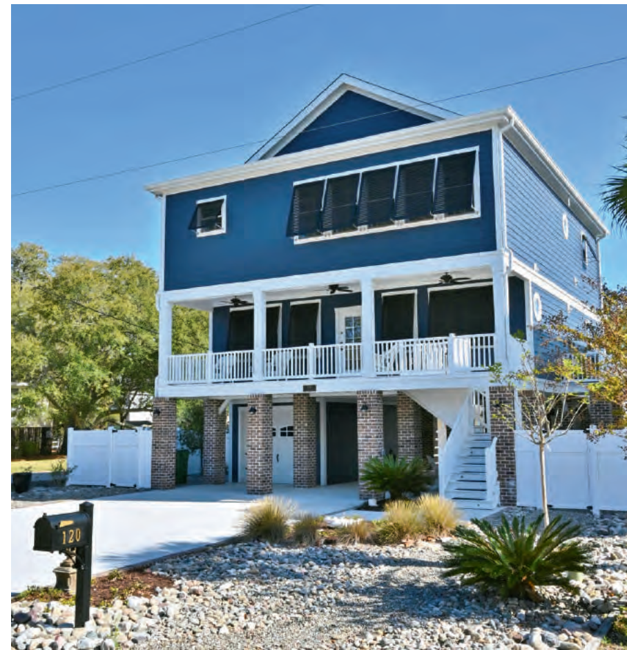
The front exterior of the Brady home in Surfside Beach mentioned on the previous page.

"It needed more dimension because I didn't like all the brick, so