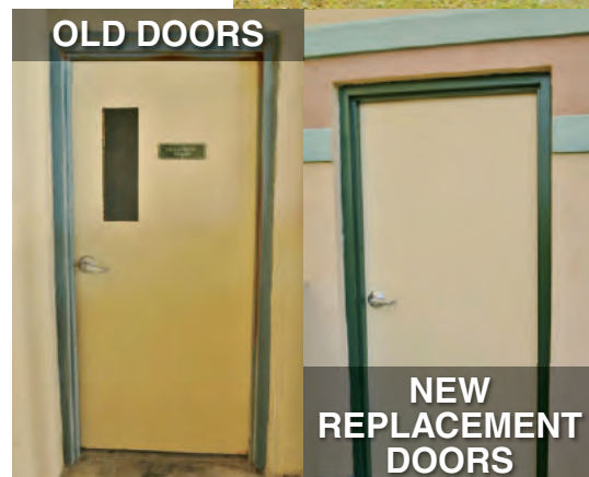
Allstar Construction Services was responsible for replacing the older fire stairway exit doors with the new doors @ this oceanfront highrise in North Myrtle Beach.