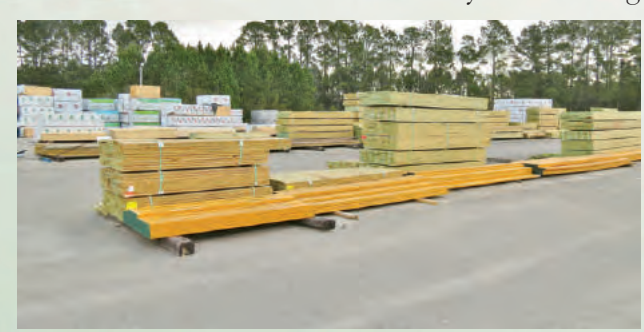
"Supplies are tight, but as one of the biggest players in the building materials game across the country, we are as well or to deliver you lumber better positioned than anyone else in sourcing material, keeping and also frame your inventories on par, and providing what our customers need to keep their jobs moving forward," says Marion.