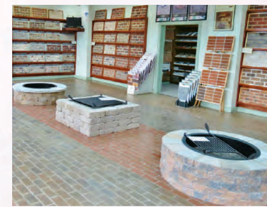
The Palmetto Brick office & showroom is located @ 305 Greenleaf Circle in Myrtle Beach (Turn towards Krispy Kreme @ traffic light on Hwy. 501).

Outdoor living also continues to be all the rage in the Grand Strand