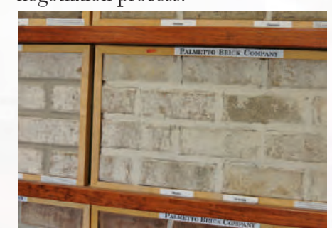
According to Redwine, the flushed old world brushed mortar joints have become popular as of late.

customers while they're still in the negotiation process.