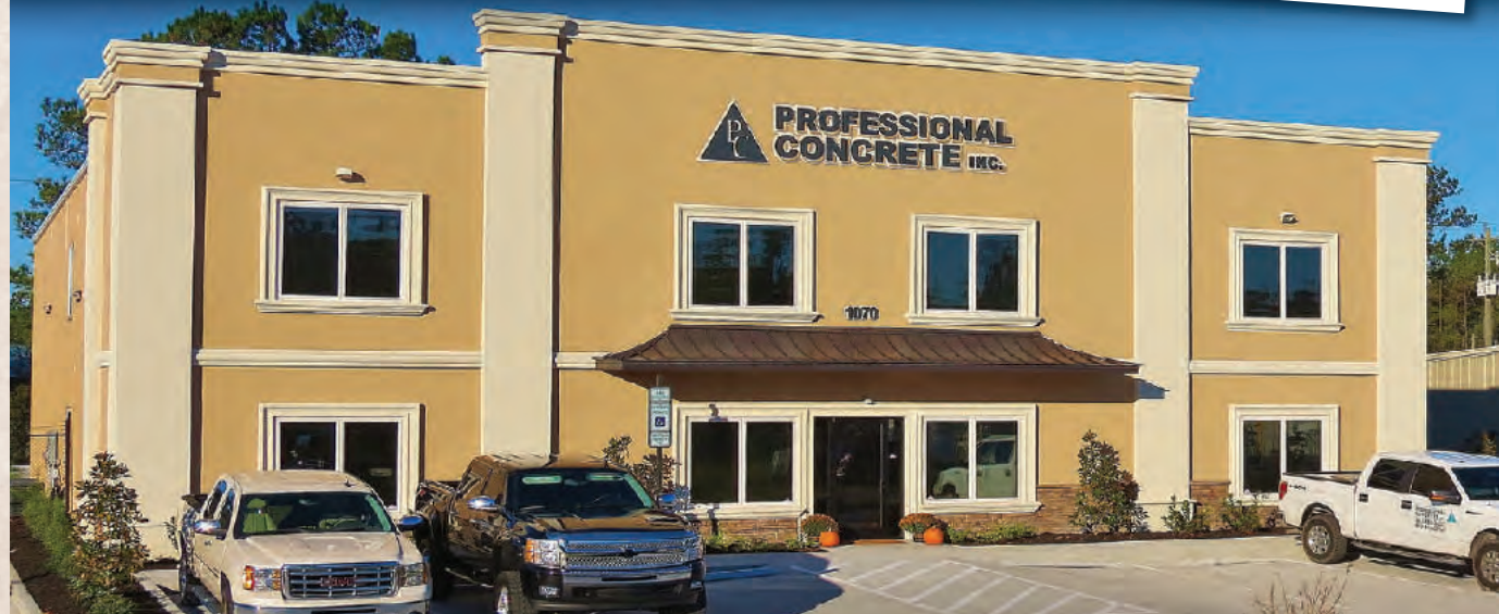
Professional Concrete is located @ 1070 Redi Mix Rd. In Little River, SC.