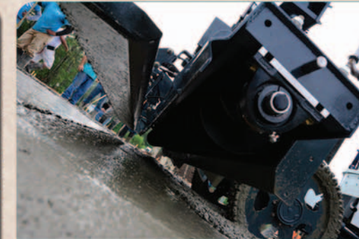
State-Of-The-Art 3D Laser Screed Machine