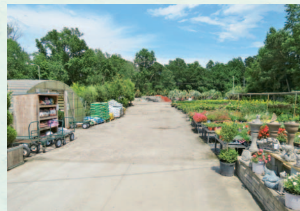
The Plants Direct Conway location @ 2019 Hwy. 544.

finish. Don't let the name mislead you — Plants Direct is a full-service outdoor living and landscaping company with knowledgeable professionals who take the time and care to customize each project and each client encounter.