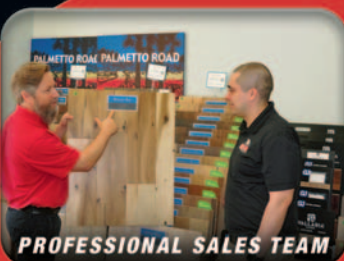
PROFESSIONAL SALES TEAM

36 Months Promotional Financing Available