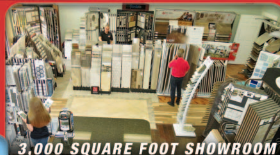
3,000 SQUARE FOOT SHOWROOM