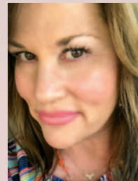
by Lesley Hill

deductible. The problem is that often, those roofs don't need replacing.