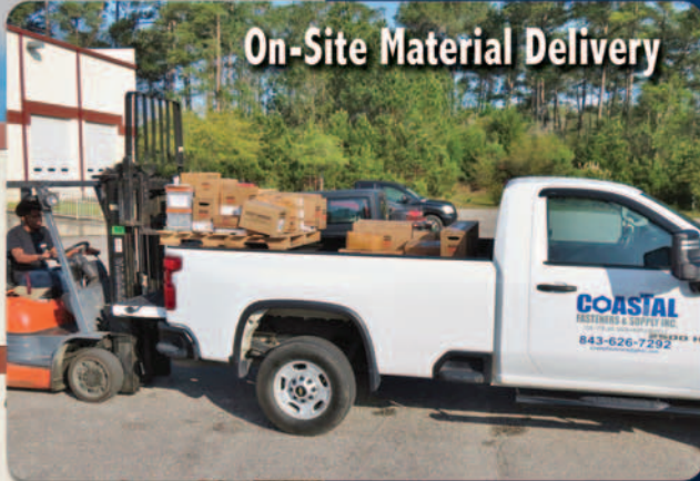
On-Site Material Delivery