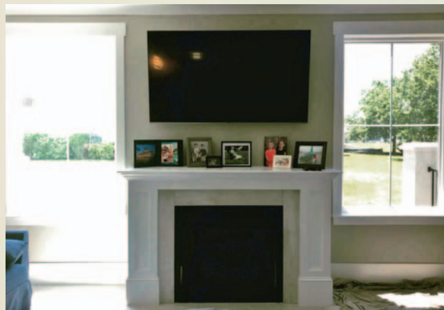
A great example of a window with film (right) vs. a window without film (left).

Often, the first topic is health, and the second is comfort.