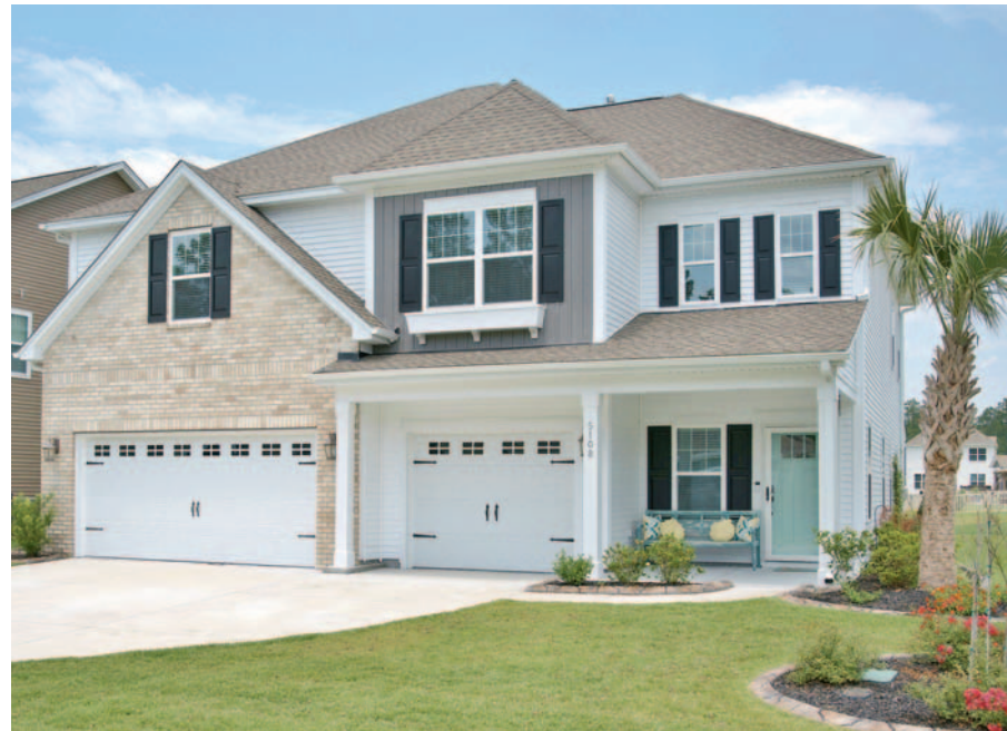
The exterior of the Warwick plan.

“They’ll discuss where they are in that process, such as are there any hiccups or what to expect next,” continues Gosnell. “We reach out to the consumer every week and update them on what’s happened on their home that week and what they can expect next week. We also get ahead of problems in this supply chain-riddled industry right now to let them know their tile selection or flooring selection won’t be available