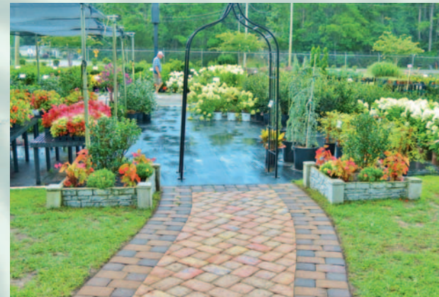
The Plants Direct Little River location @ 1741 Hwy. 57 North.

"We can take a job from start to finish. That's certainly one of the most important things we do. The customer likes that approach because they only have to deal with one contractor instead of multiple people. It just always seems to muddy the waters, the more people you have to deal with; if you have one contact, it really helps.