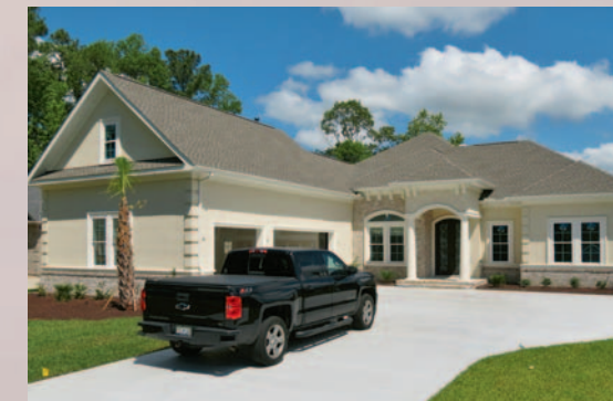
Suncoast Building Products & Services installed the gutters on this home built by MJM Custom Homes & Remodeling.