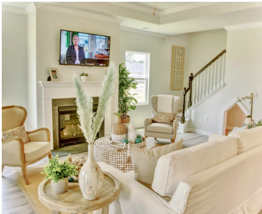
The living area in the Gwinnett plan.