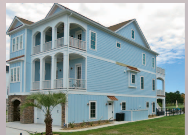
Suncoast Building Products & Services installed the gutters on this home built by K & B Custom Homes.

company’s General Manager. We are thankful for our small but mighty team of office staff and skilled technicians. You can visit their showroom at 1703 Park View Road, Conway, SC 29526. ■