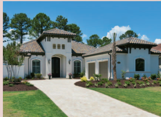
Suncoast Building Products & Services installed the gutters on this home built by Classic Homes.