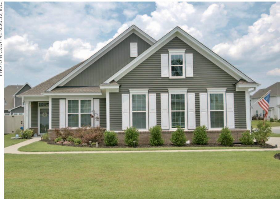
The exterior of the Chadwick plan with a side load garage.

Here’s a closer look at the current roster of active Mungo Homes communities on the Grand Strand: