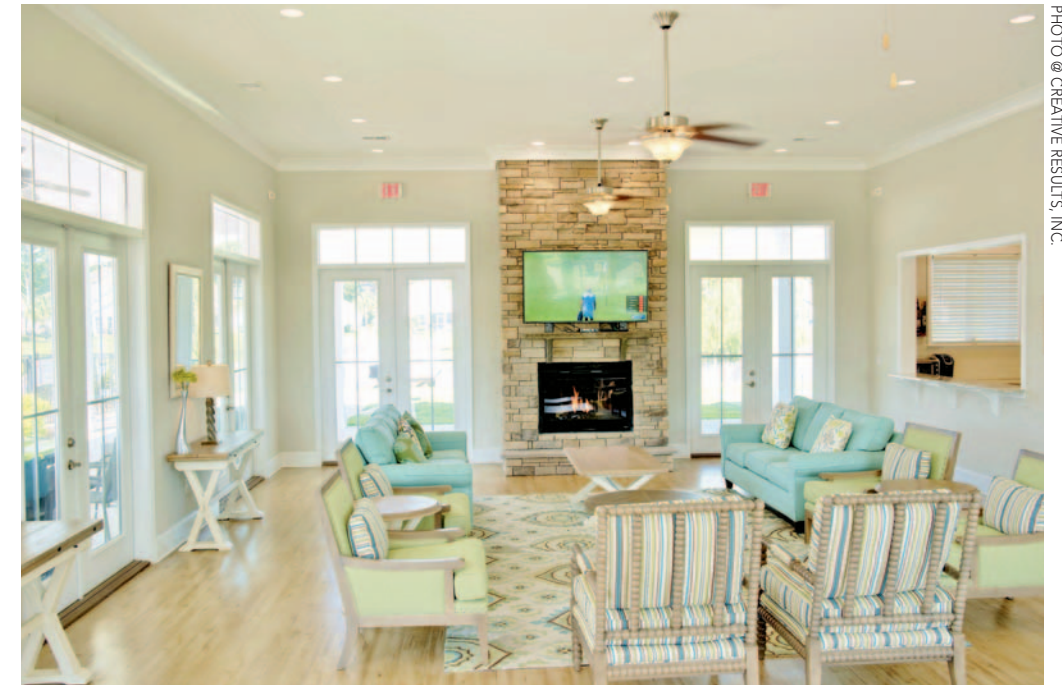
The amenities center in Cypress Village.

“We’ve marketed Cypress Village, because it’s an incredibly active retired homeowner group, by saying ‘only fun people live here,’” laughs O’Quinn. “They’re all very involved in the neighborhood, they