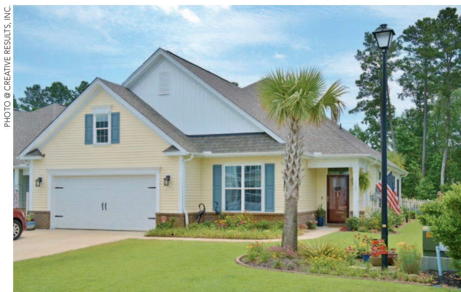
The exterior of the Chadwick plan with a front load garage.

And Mungo Homes has not stopped growing its communities from Conway to the coast, feeding the growing need for quality ways to live, work, and play in this hot market. For more information and updates, visit Mungo.com . ■