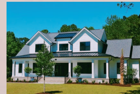
Suncoast Building Products & Services installed the gutters on this home built by Heritage Building & Design.

foliage is easier with a reliable “Pine/Leaf Gutter Guard Protection System”. He recommends cleaning several times a year or adding one of