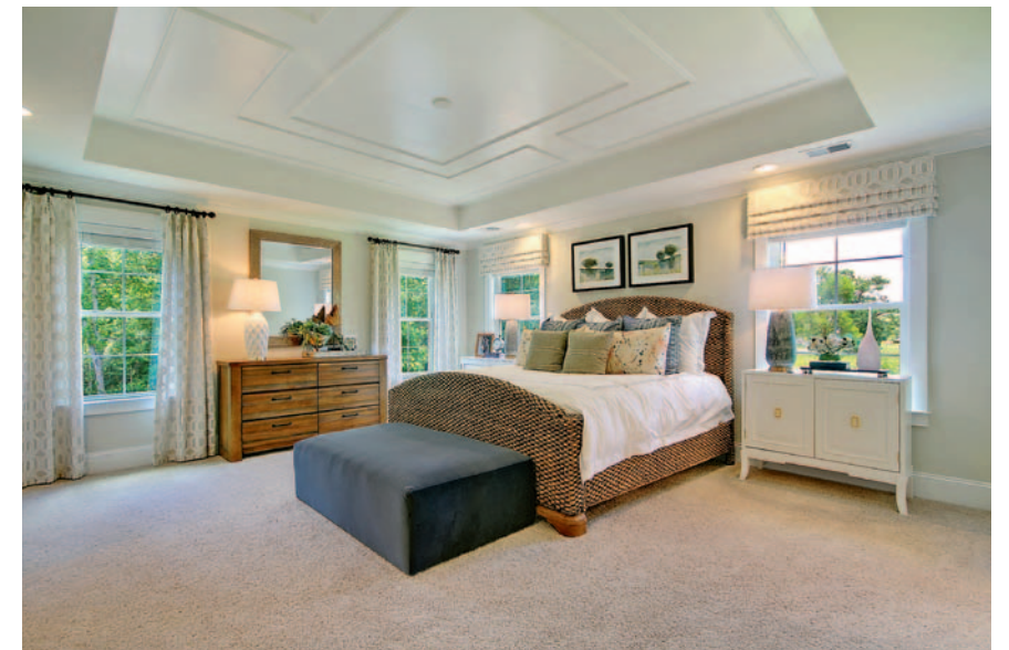
The interior of the Warwick plan.