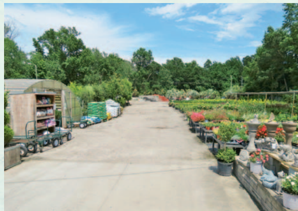
The Plants Direct Conway location @ 2019 Hwy. 544.

Specializing In Landscape Design & Installation From Start To Finish