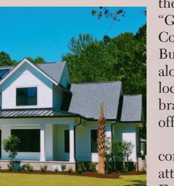
Suncoast Building Products & Services installed the gutters on this home built by Heritage Building & Design.

company's General Manager. We are thankful for our small but mighty Excellent craftsmanship, team of office staff and skilled and offering Superior technicians. You can visit their our guards to capture falling pine Products at the Best Price. Our showroom at 1703 Park View Road,