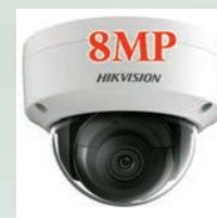
8 MP Camera

1460 Dividend Loop, Suite B, Myrtle Beach, SC 29577 AffordableLuxuryAwningsSC.com