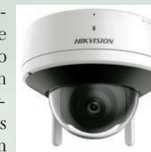
AcuSense WiFi Dome Camera

AcuSense technology uses simple configurations to define a minimum and maximum target size for humans and vehicles in order to identify alert-worthy events based on the configured criteria, thus ensuring notifications only trigger when necessary, not just based on motion which can be driven by lighting changes and wind. Our newest line of Analog DVRs, what we call "Tribrid DVRs" include AcuSense capabilities as well in order to bring this exceptional feature to all customers, whether they are using existing Coax cabling or running new