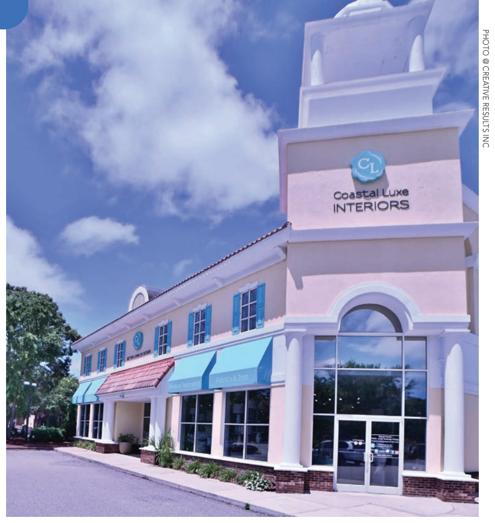
The Coastal Luxe Interiors Showroom is located @ 6613 N. Kings Hwy. in Myrtle Beach.