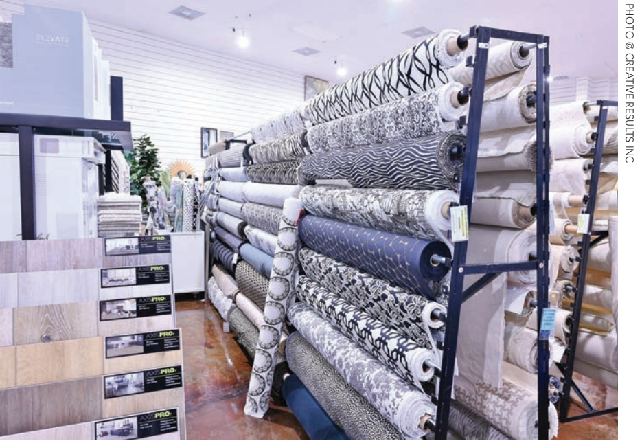
The Coastal Luxe Interiors showroom includes a library of fabric in a variety of colors and textures for any type of project in need of this very important interior element.