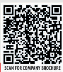
SCAN FOR COMPANY BROCHURE

Info@SecurityVisionMB.com | www.SecurityVisionMB.com 3650 Claypond Rd. • Suite A • Myrtle Beach • SC • 29579