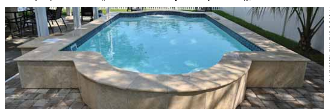
Elko designed this pool partially out of the ground. This helps with water flooding in the yard and also provides additional seating for the swimmers.

builders and contractors, who trust them enough to refer them to their clients. Transparent communication is conducted with local or national builders and contractors to order and schedule a pool build, as well as install the products in its chosen place before, during or after the house is completed. They also finesse the logistics with builders if a hot tub is going onto a second or third story of a high-rise building and they can also plan out commercial amenity centers to house Elko gaming tables.