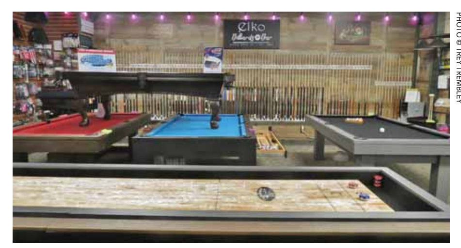
Bigger is Better! The Elko showroom has gone through vast renovations. It now showcases the Dart Den, Pool Stick Alley, and a great selection of game room tables, in addition to all of their snas.

Best of the Beach, Best of the Grand Strand, Best of the Horry Independent, Best of the Herald, Best of North Strand, Best of the South Strand and Best of Carolina Forest. They have been voted the dealership of the year repeatedly over the years. Elko has won international awards.