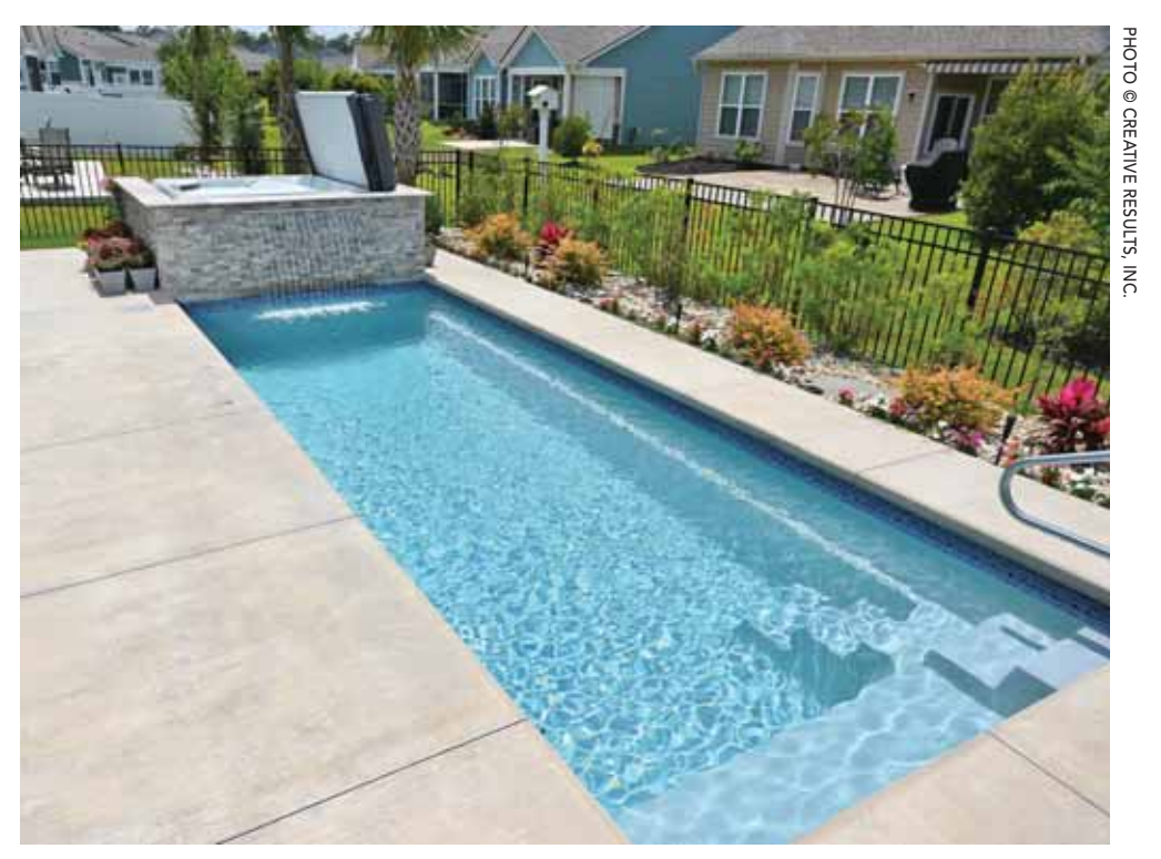
Small space design with enormous impact! Wrapped and stacked travertine hugs a HotSpring spa with a waterfall spilling into the fiberglass pool @ the home of Eugene Chiulli.

Verlon Wulf has entrusted Elko Spas to move and put back together his 40 year old antique pool table to six different