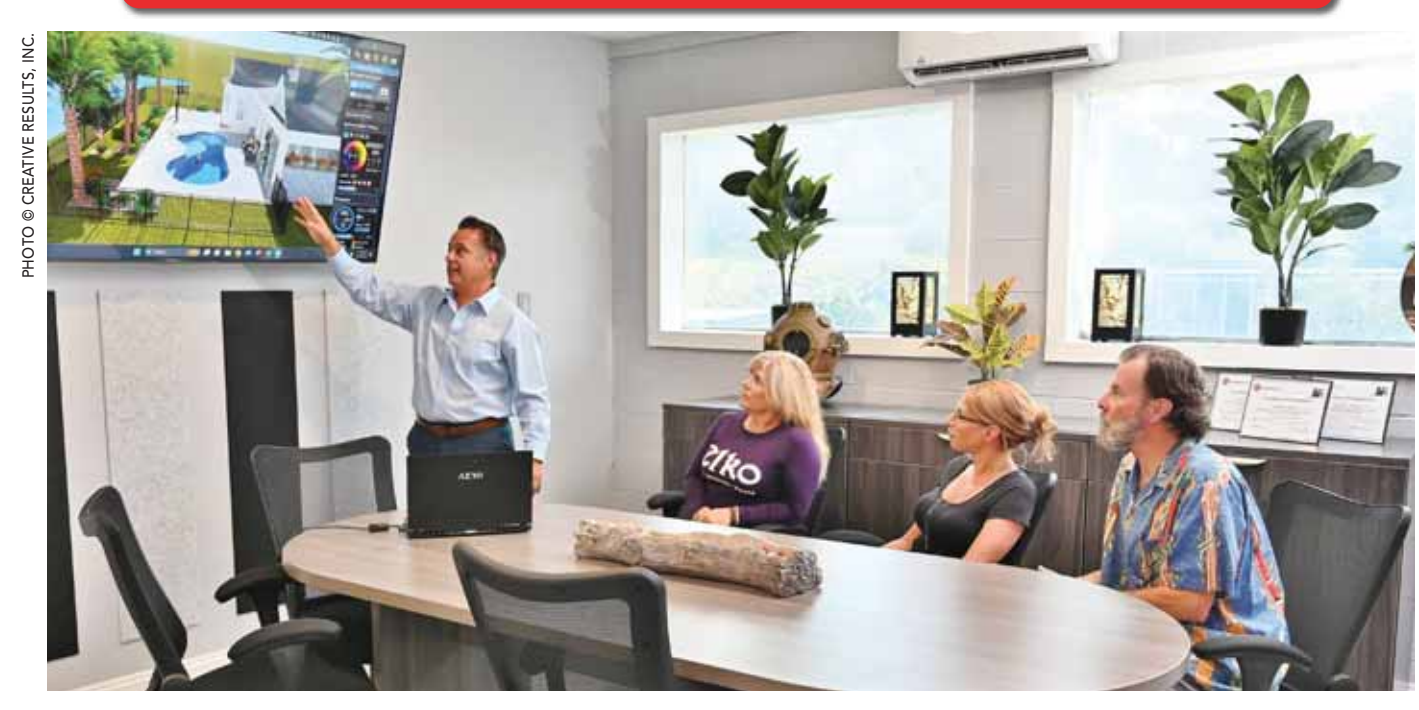
The Elko corporate conference room is a unique space that allows customers to relax and preview their dream project.

VISIT THE PROFESSIONALS WITH ELKO SPAS BILLIARDS & POOLS IN BOOTHS 108 - 109 110 - 111 SEPTEMBER 15TH - 17TH IN THE MYRTLE BEACH CONVENTION CENTER