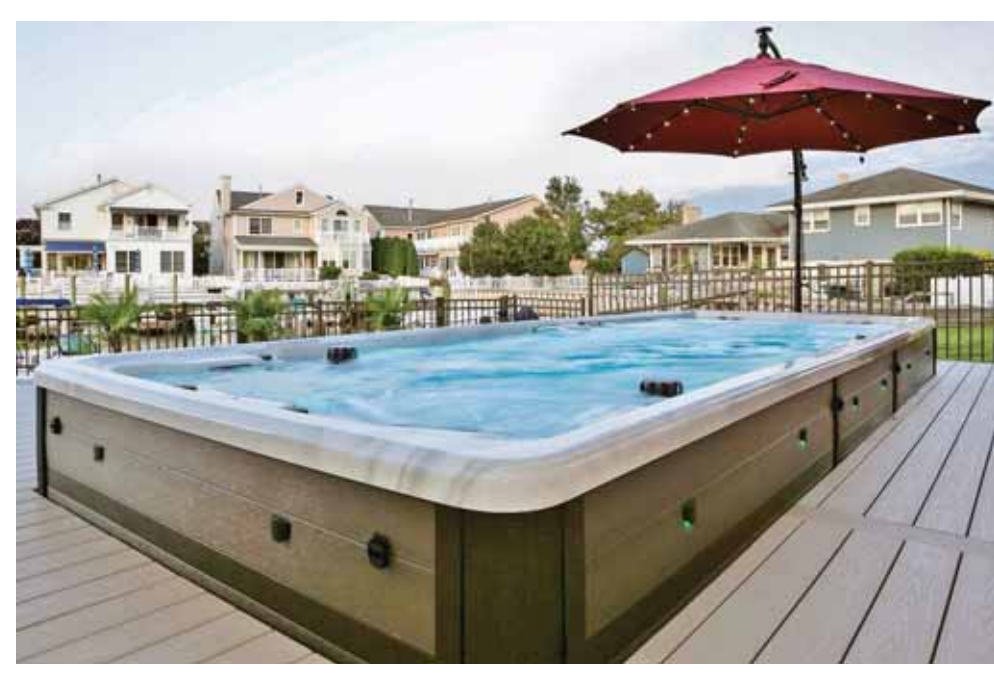
A swim spa installed on the customer's deck on the water.

Services offered are free hot tub water testing, repair, service, parts, cleaning, drain and cleans, as well as moving hot tubs. Elko is an authorized service and warranty center for