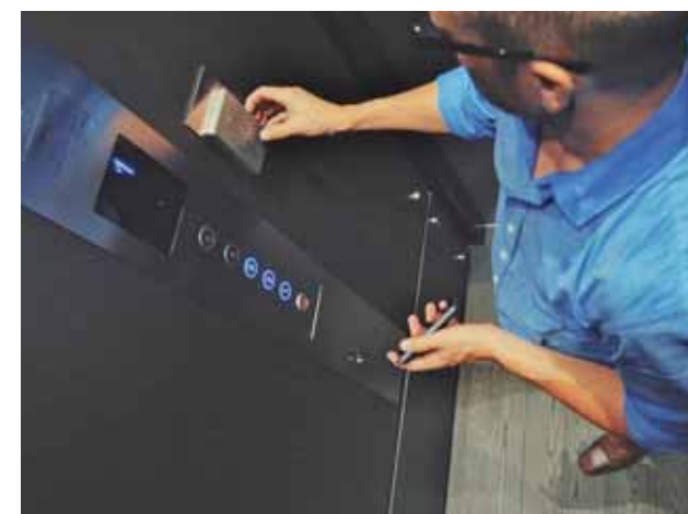
Optional security keypads are available for homeowners who use their homes for vacation rentals.

With a foundation of honesty and integrity, not only have they