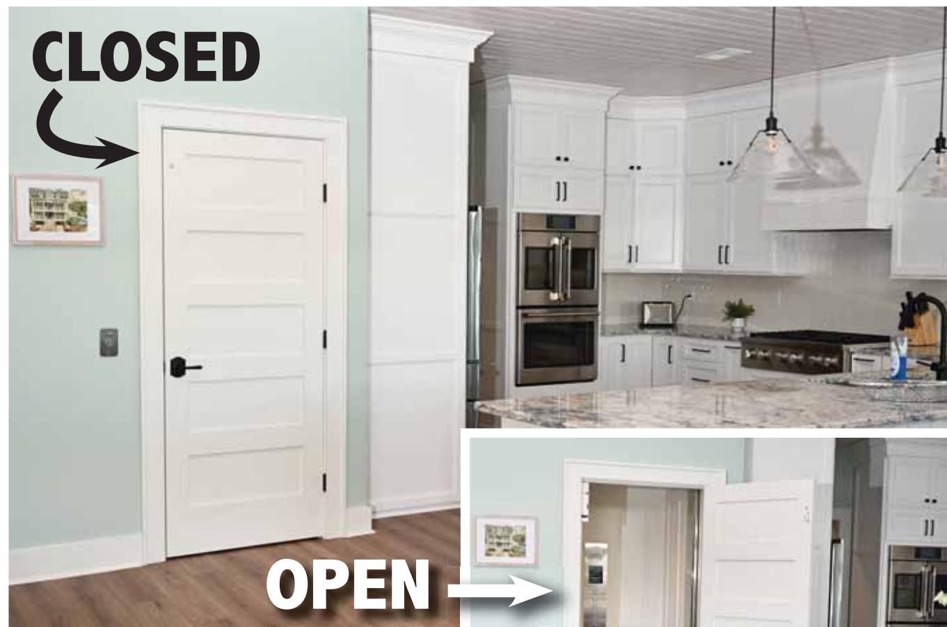
The craftsmanship of the interior elevators compliments each home’s décor.

island and shorted out the new elevator.