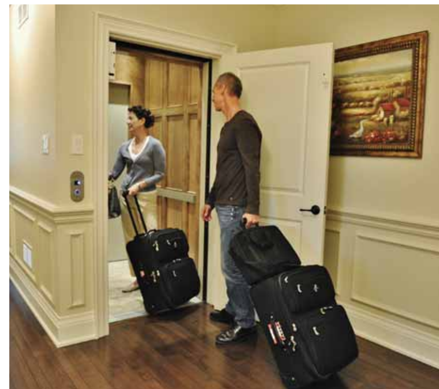
Cambridge Elevating offers 9 million design options to fit your home aesthetic perfectly.

and services residential clients throughout Horry, Georgetown, Marion, and Brunswick counties who need elevators, dumbwaiters, outdoor lifts, and stair chairs.