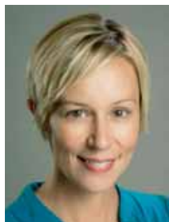
by Ashley Daniels

VISIT THE PROFESSIONALS WITH ELEVATORS PLUS IN BOOTHS 411 & 412 FEBRUARY 2ND - 4TH IN THE MYRTLE BEACH CONVENTION CENTER