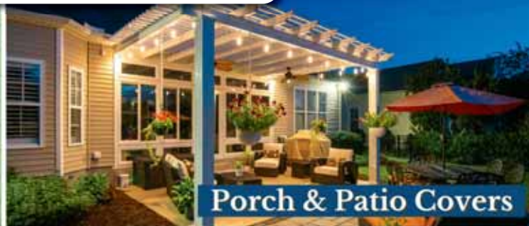
Porch & Patio Covers