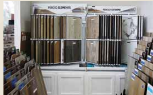
Creative Flooring Designs is a proud dealer for Pergo Elements & Pergo Extreme flooring. Their showroom is located @ 12082 Hwy. 17 Bypass in Murrells Inlet, SC.

both features WetProtect waterproof technology, providing the right kind of waterproof. Patented Uniclic locking technology and precision milling provide the tightest locking system of any hard surface flooring, preventing the need to replace and reinstall due to damaged subfloors. The waterproof finish repels water away from the joints and traps