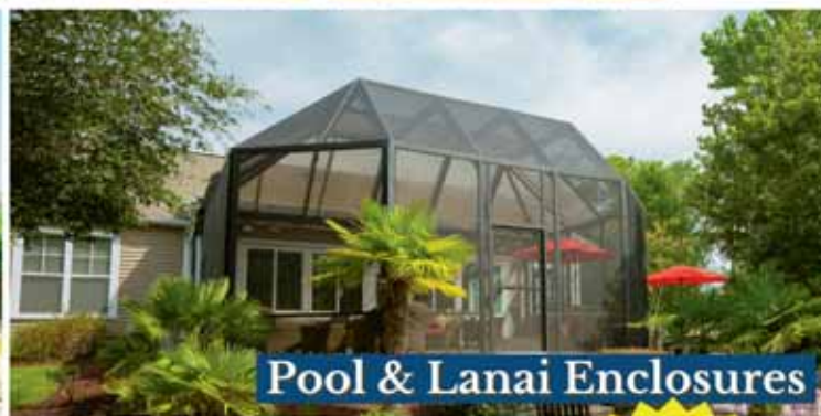
Pool & Lanai Enclosures