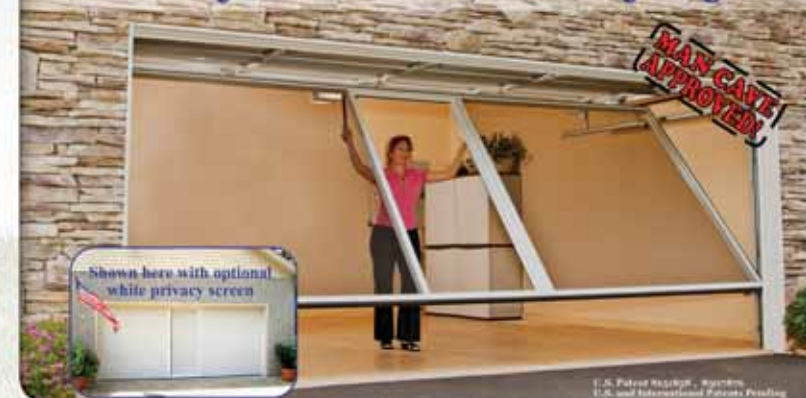
Shown here with optional white privacy screen

It's not just a screen, it's a Lifestyle.