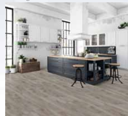
Hardwood – Atlantic Boca Grande

guarantees that customers receive flooring solutions that can withstand