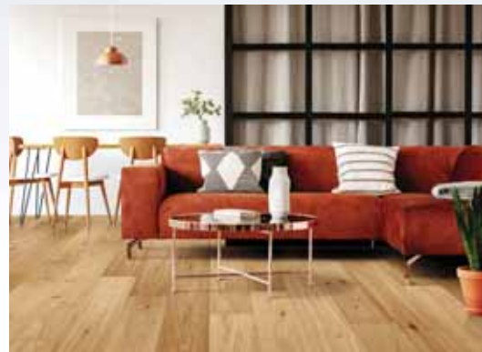
Laminate – All American Premium Croft Oak Natural

the test of time, maintaining their beauty and functionality for years to come.