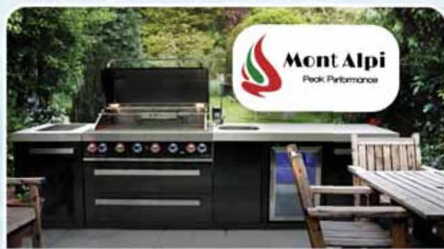
Transform Your Backyard With A Stunning Outdoor Kitchen From Mont Alpi

1228 Port Dr. - Myrtle Beach - SC - 29577