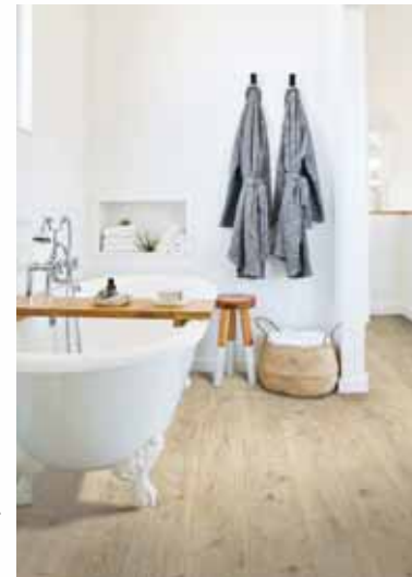
Ceramic - Himalaya Alpine Lasa Beige

One of the key advantages of Chesapeake Flooring lies in the vast array of designs and styles available. Whether you're seeking the timeless elegance of hardwood, the versatility of luxury vinyl, the durability of laminate, or the sleek lines and bold patterns of tile, Chesapeake offers a diverse range of options to suit any aesthetic preference. With an extensive selection of colors, patterns, and textures, homeowners can effortlessly find the perfect flooring to enhance their unique spaces.