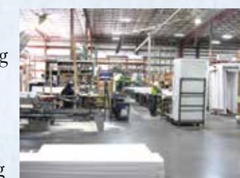
BFS has a state-of-the-art manufacturing facility onsite @ their Conway, SC location.

“We’re continuing to develop our manufacturing right here on site,” said Kress. “We’re expanding our door shop, providing new