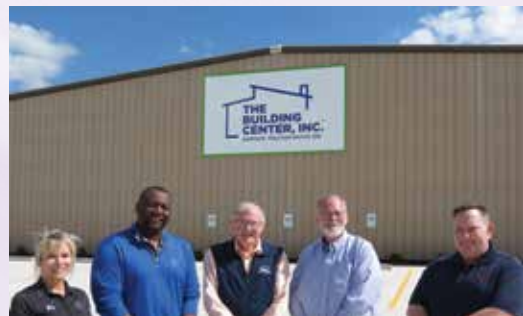
The Building Center is very proud of the professional sales staff they have assembled to handle all of your building supply needs in this market.