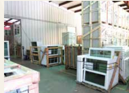
Home Design Extras has a large in stock inventory to better serve the local building contractors.

For Home Design Extras, the three key factors of price, quality, and service are inter-related, and Slack's approach is simple.