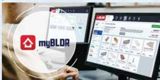
The myBLDR.com platform allows builders to see their builds, their deliveries, their plans & ask for estimates.

Builders FirstSource (BFS) is taking home building to the next level, using cutting-edge technology to bring enhanced efficiency, transparency, and convenience to the home building process.