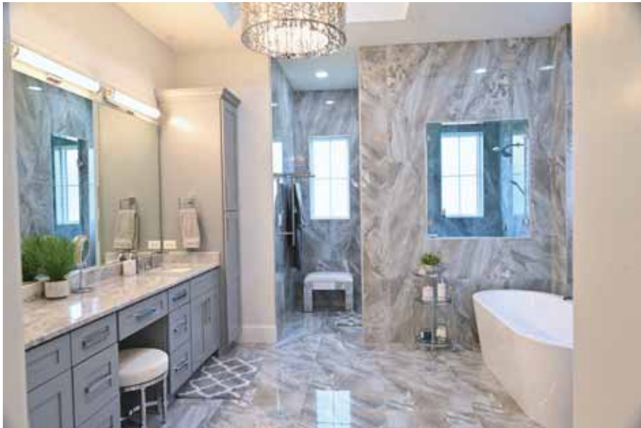
This exquisite master bathroom with a steam shower and free-standing tub creates a feeling of tranquility, comfort and rejuvenation, providing a space to unwind and escape the stresses of daily life.