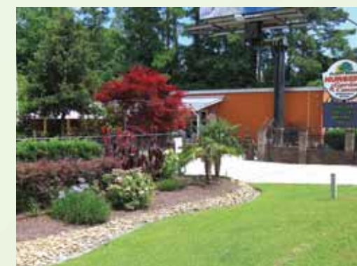
The Conway location @ 2019 Hwy. 544.

always be there to have my eyes on the project, help manage it, and make sure it runs smoothly."