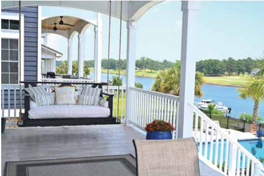
This exterior porch is a delightful and serene addition to any property, providing a unique and relaxing experience.

"I always enjoyed going to the job site more than going to the playground," Slattery Jr. says with