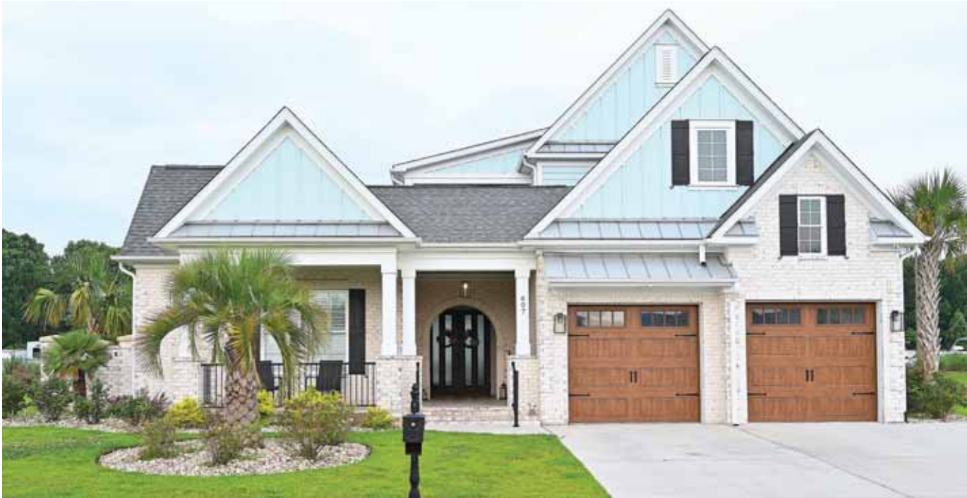
This exterior harmoniously blends aesthetics, functionality and environmental considerations, creating an inviting and everlasting impression.