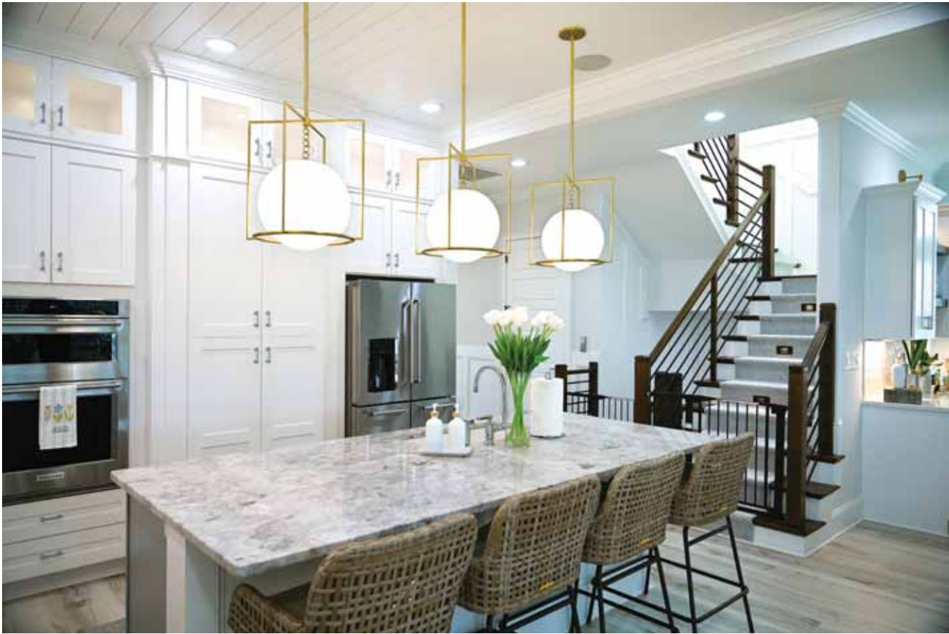
This bright open kitchen combines natural light, exquisite lighting fixtures, spacious design, and thoughtful details, creating a welcoming and functional space.