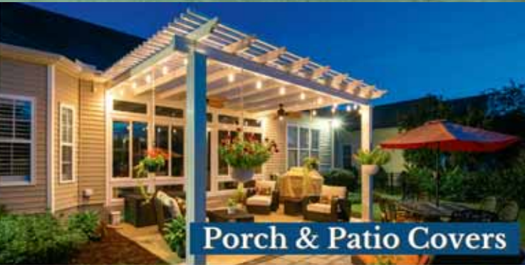
Porch & Patio Covers