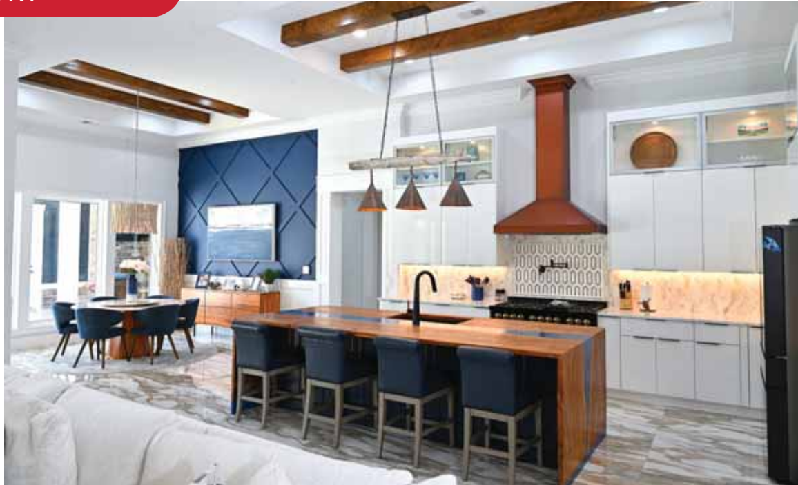
Every detail of this communal space was designed to the clients’ desires. Beach Custom Homes strives to fulfill their clients’ vision in each build.