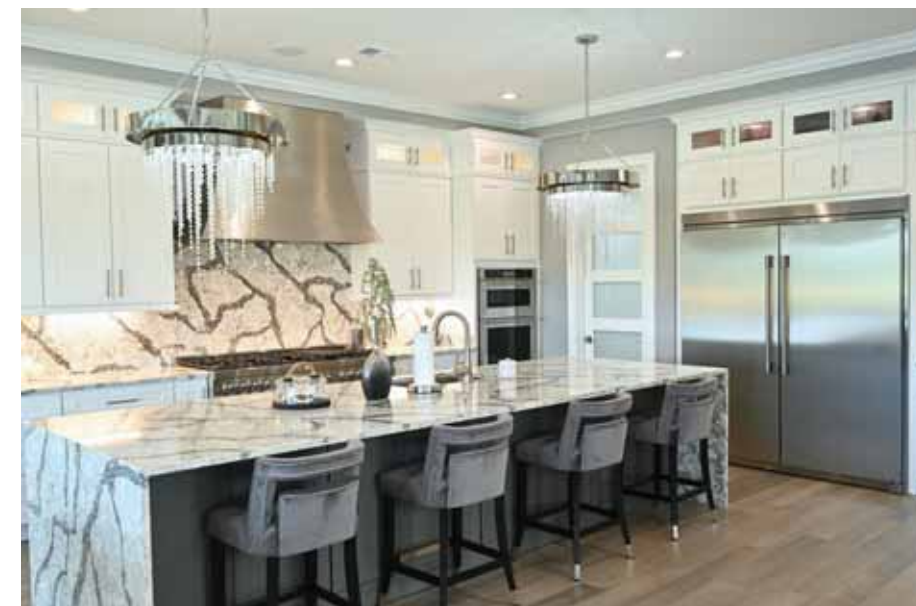
Turning your dream kitchen into reality involves careful planning, attention to detail, and a clear vision of your preferences and needs.