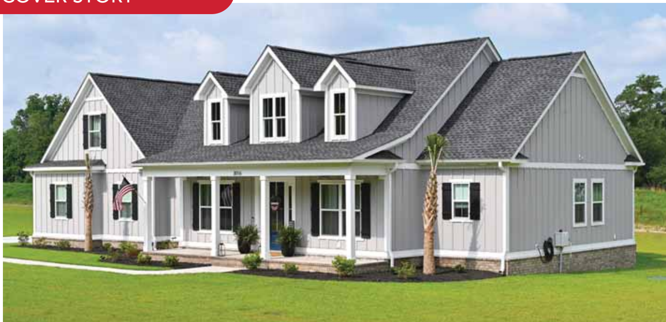
This Low Country home embodies a blend of Southern charm, comfort, and functionality, evoking a sense of warmth and timeless appeal.

The customized dream home results of Beach Custom Homes can be seen throughout many prestigious neighborhoods up and down the Grand Strand, such as Waterway Palms, Plantation Lakes, The Battery, Carolina Waterway, Cypress River and Wildhorse, to name a few. Many of their homes are three-story direct luxury waterfront homes.