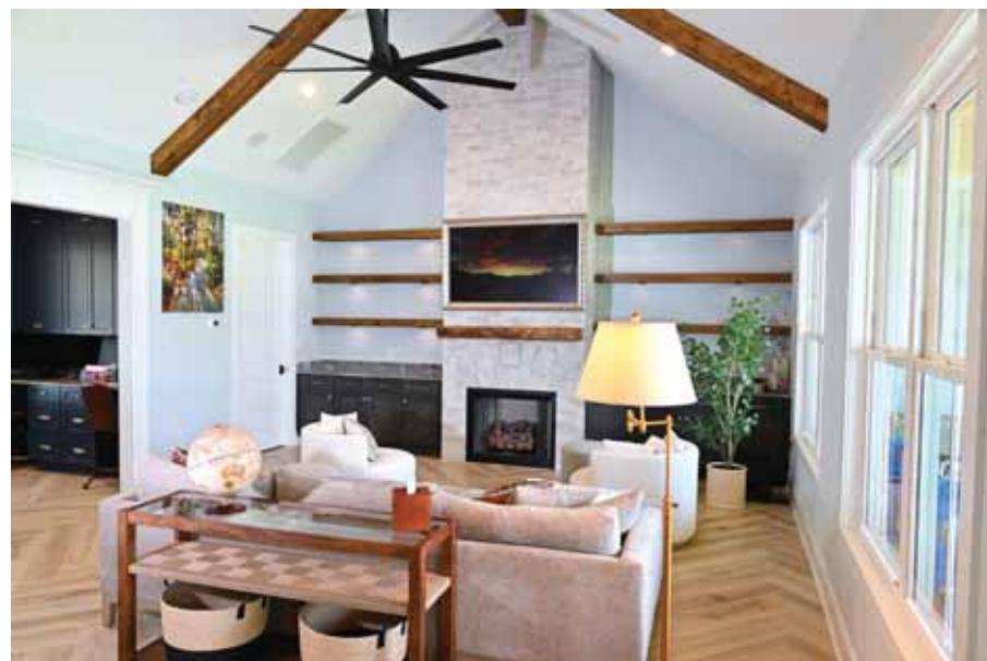
This open concept living room with exposed beams, herringbone tile floor and wood accents creates a unique space that is a welcoming retreat within the home.

“When we build houses and we leave them, I know these families are going to create memories,” says Slattery Sr. “A