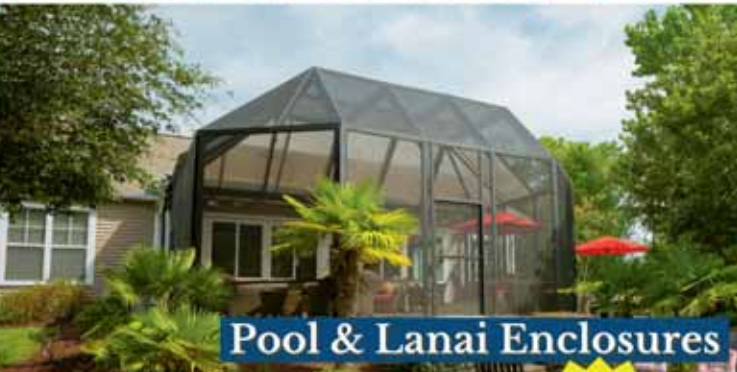
Pool & Lanai Enclosures