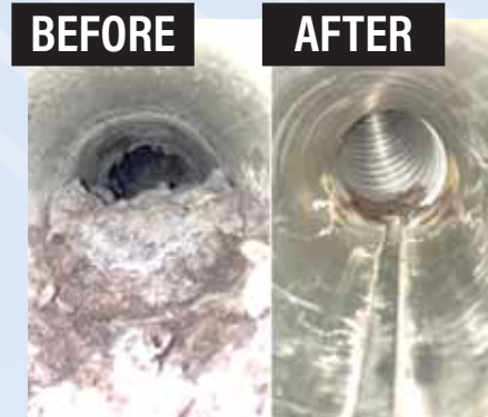
Carolina Temperature Control also cleans dryer vents.

Water heaters are another major household appliance that is often overlooked for recurring preventative maintenance. "For our annual traditional tank or tankless water heater tune-ups, we flush the water heater, clean filters, check