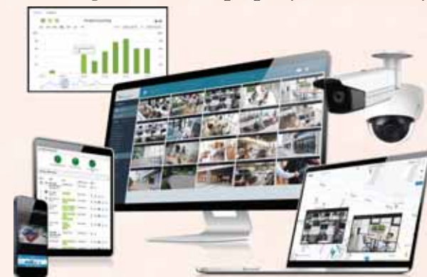
Security Vision offers three advanced technologies as part of an integrated system or as stand alone solution, depending on the clients needs.

Security Vision is at the forefront of innovation, continuously adopting new technologies that make property