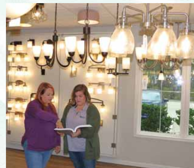
The Trusted Home Services showroom is located @ 1516 East Hwy. 501 - Suite 105 in Conway (next to Beverly Homes). The showroom features lighting, appliances, security, generators & water filtration.

homeowners will need to consider cost and availability of the older refrigerant when they are considering repairs. "The 410A will go up in price because it will become scarce and less widely used, so we tell homeowners