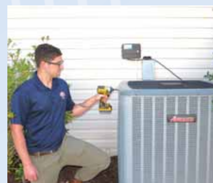
Carolina Temperature Control offers one of the most comprehensive HVAC maintenance packages in the area.

CTC also offers one of the most comprehensive HVAC maintenance packages in the area. "When speaking with customers, we try to emphasize