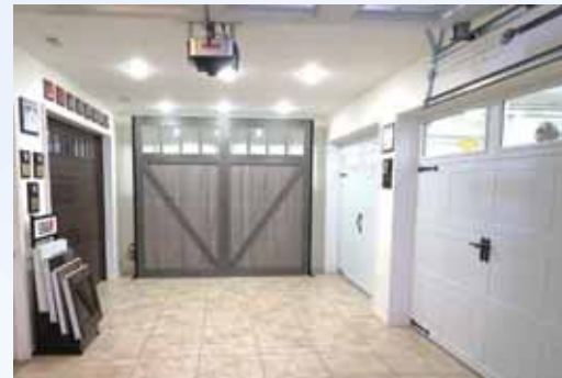
The Grand Strand Garage Doors' showroom, located @ 5480 W. Hwy. 501 in Conway, SC, is fully functional with a working garage door & privacy screen.

This commitment to exceptional customer service has not gone unnoticed, earning Grand Strand Garage Door a stellar reputation within the community. Positive word-of-mouth endorsements and repeat business are a testament to the company's ethos of prioritizing customer satisfaction above all else.