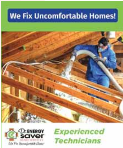
Carolina Energy Conservation is a Dr. Energy Saver dealer offering solutions for all types of home comfort issues.