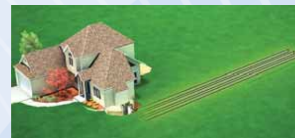
An example of the geothermal HVAC system's horizontal loop.

CTC is the largest installer and service provider of geothermal HVAC systems in Northeast South Carolina. As energy costs rise and the government continues to offer tax credits of up to 55% for installing geothermal heating and air conditioning systems, it has become increasingly desirable for both residential and commercial applications. Geothermal involves installing pipes filled with water