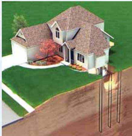
An example of the geothermal HVAC system's vertical loop.

to leverage the Earth's consistent temperature underground and avoid the extreme temperature variations we experience above the surface. The benefits of geothermal systems vs.