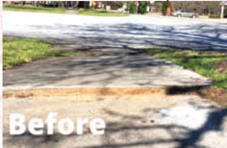
Carolina Foam Pros also offers concrete leveling for driveways, garage floors, sidewalks, pool decks & more.

HVAC system, energy consumption can be reduced nearly 40%,” said Pauline Medford, owner of Carolina Foam Pros. “Those are huge numbers. SPF also increases the longevity of homes, buildings and structures potentially reducing insurance costs. A roof deck with closed cell SPF is unlikely to blow