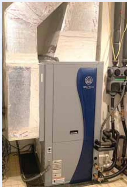
The interior installation for the Water Furnace geothermal HVAC system.

traditional HVAC systems include: 1) 50%-70% savings in energy costs, 2) up to 55% back in federal and state tax credits, 3) geothermal equipment is rated to last 20-25 years (2x-3x longer than traditional HVAC systems), and 4) geothermal