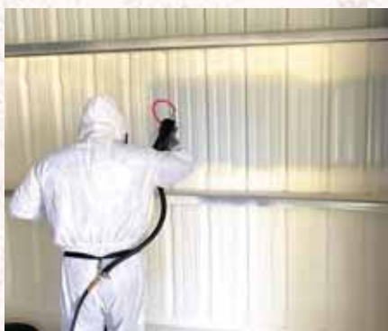
Spray Polyurethane Foam is often used in metal buildings.

away in a hurricane. Closed cell SPF can increase structural integrity up to 300 percent over traditional insulation.” Open cell SPF is a less expensive option, up to 30 percent less, than