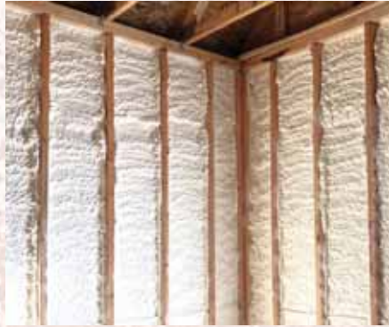
Spray Foam Polyurethane can reduce energy consumption nearly 40%.

When it comes to Spray Polyurethane Foam, whether for residential or commercial insulation, man-caves or she-sheds insulation, concrete lifting, seawall repairs or roof coatings, Carolina Foam Pros is the most experienced and knowledgeable in the business. Founded in 2016, Carolina Foam Pros offers leading-edge expertise and technology in the Spray Polyurethane Foam (SPF) industry.