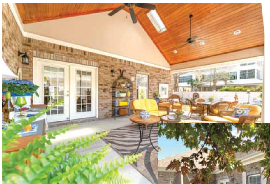
The new covered porch addition in the rear of the residence of Beth Ervin Morrow and John Morrow in Myrtle Beach. ReBuilders completed this design / build which includes a vaulted wood ceiling and sky lights.

"I chose Rebuilders because they are a long-time local company with a reputation of good