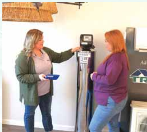
Trusted Home Services sells & installs the Halo water filtration system.

In the HVAC field, a recent shift in industry standards means Trusted Home Services